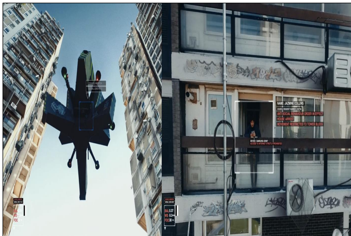
Figure 1. Drones and state surveillance

The two teenagers portrayed in the film are positioned both as prisoners, objects of state surveillance who are held in home custody, and as lovers who exchange notes through drones which they have hacked and appropriated for their own socio-emotional purposes. In the former case, the writing practices appear as authored by the drones, thus placing the film spectator in the capacity of a ratified addressee who is engaged in surveillance and monitoring of the individual teenager subjects through side-played communication with the drones (see Figure 1).