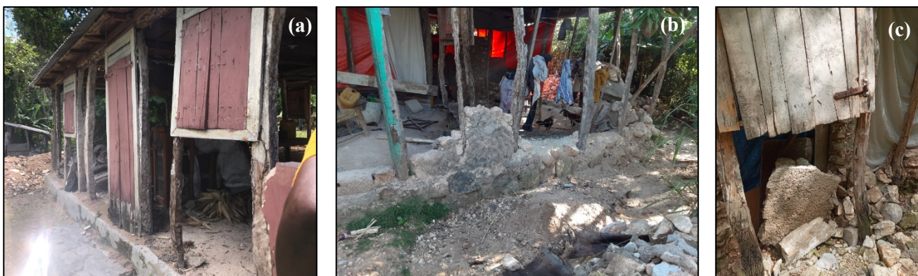
Figure 2. Examples of moisture decay were observed in wooden frames (Earthquake-induced structural damage is severe for each).

During the damage assessment process, we identified moisture-related problems decreasing the resilience of the typology: weathering, insect attack, rising damp, and moisture decay on wooden posts, which then manifest as significant section losses lessened adhesion between framing and infill, and loss of connections adversely impacting on structural performance under seismic loading as demonstrated by more than a third of severely damaged buildings (57/154). Figure 2 displays some of the severe damage cases that moisture decay observed in the framing. In both (a) and (b), longitudinal posts seem to have been rotten due to moisture, which prominently affects the quality of wood and connection. On the other hand, the affected section of posts in (c) is at the foot, which has traces of rising damp.