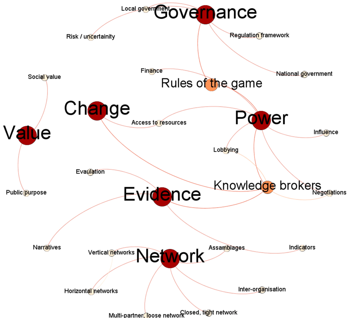
Fig. 1. : A snapshot of our interdisciplinary collaborative work on Miro showing a network graph of the overlapping concepts.

Integrating the different disciplinary perspectives and theories relevant to our project into a single-page document proved difficult.