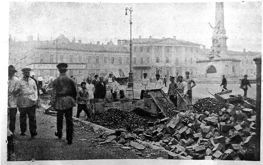
Figure 1. "Paving Works on The Square of Soviets." The replacement of cobbles with asphalt illustrated as a triumph in the journal Stroitel'stvo Moskv y in 1924. "Blagoustroistvo Gor. Moskv,y," Stroitel'stvo Moskv y 1 (1924): 19–22, 15.