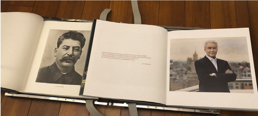
Figure 4. I. V. Stalin in the 2018 re-issue of Moskva Rekonstruiyuetsya (Moscow: Institut izobrazitel'noi statistiki sovet'skogo stroitel'stva i khoziaistva tsunkhu gosplana sssr, 2018[1938]); and S. Sobyenin in 2018's Moskva Razvivaetsia (Proekt Moskva: Gradostroitel'naia Letopis' Stolitsy XX–XXI Vekov (Moscow: Institut Genplana Moskvy, 2018), authors' photo.

and making money for developers, construction firms, and urban consultancies. As in the 1860s, 1910s, and 1920s, it is about creating, from above, a new, better, classier —or, in the preferred adjective of today's cognitive techno-determinism, “ smarter ”—type of Muscovite. It is about forging a model of urban aesthetics, government, and subjectivity that can be imposed, coercively or otherwise, on the country's provinces and peripheries, and even its neighbors.