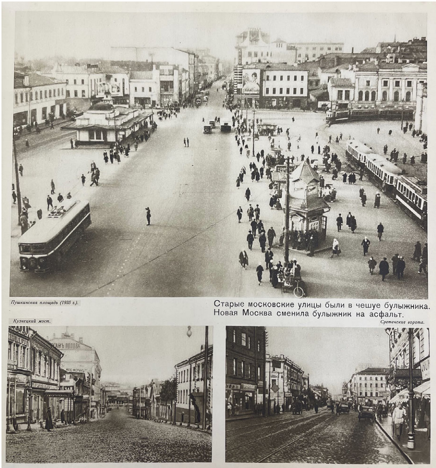
Figure 2. “Old Moscow streets were covered with cobblestones. New Moscow changed the cobbles into asphalt.” Before-and-after image from Moskva Rekonstruiroetsia (Moscow: Institut izobrazitel’noi statistiki sovetskogo stroitel’sтва i khoziaistva tsunkhu gosplana sssr, 1938), n.p.

1920s and 1930s covers blagoustroistvo in a short, technical subsection within the article “city.” The second, published in the 1950s, dedicates to it an article that runs across several spreads, boasts rich illustrations, and opens by proclaiming that the task of blagoustroistvo expresses “the tireless concern of the Bolshevik Party and the socialist state to improve the welfare of the people” (see figure 3). 52 During post-Stalinist decades, projects and imagery of urban improvement remained central to Soviet rhetoric and iconography, with Moscow as its model. These were the myths and dynamics of space and power that post-Soviet society inherited and had to navigate. In Moscow, the first two post-Soviet decades