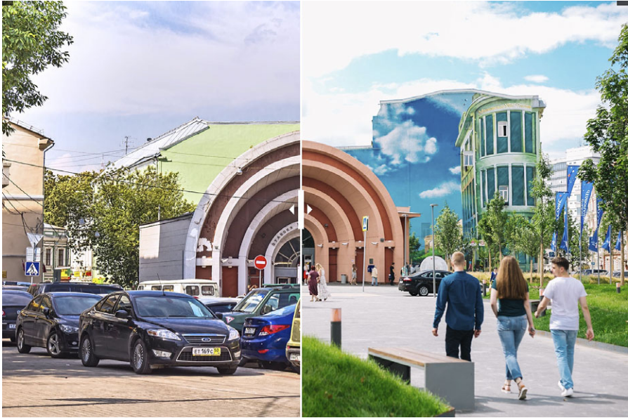
Figure 5. Screenshot of before-and-after sliding image of the Krasnye Vorota metro station, from https://media.strelka-kb.com/before-after . Image courtesy of KB Strelka.