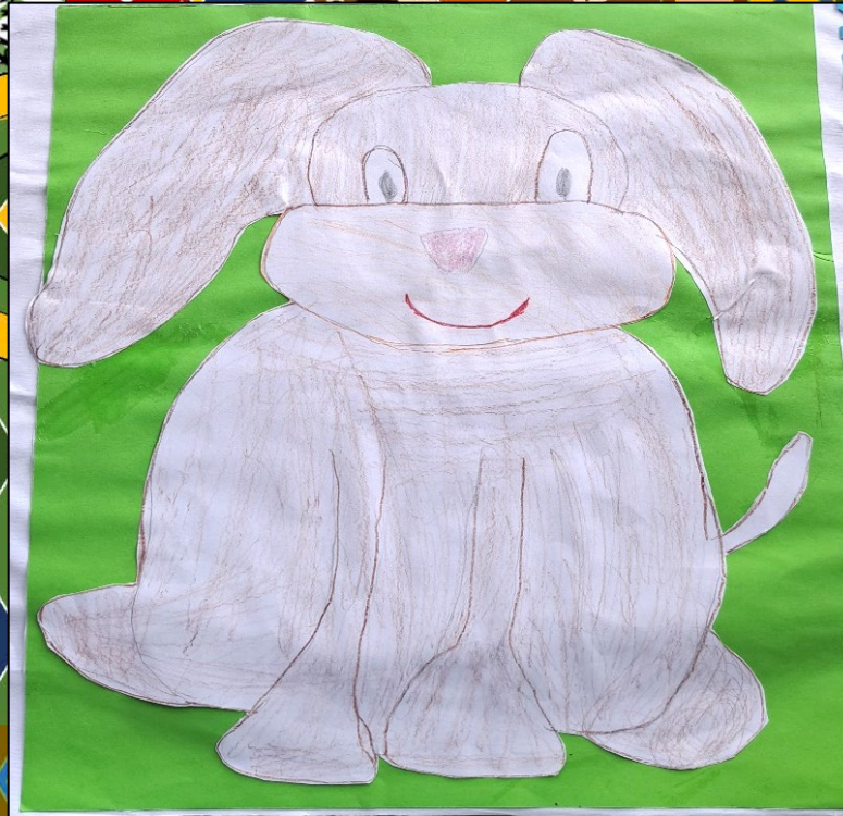
Bobby the talking dog