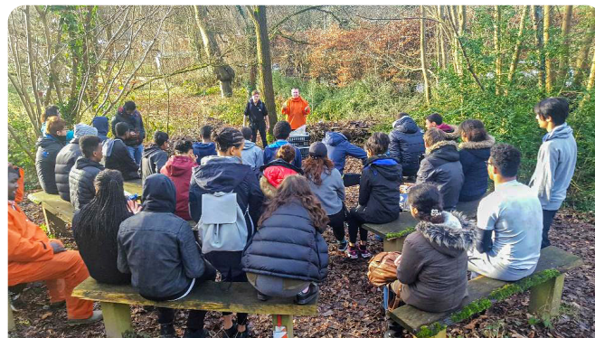
Figure 1 Biology A-level students commencing a fieldwork day

The research sought to capture and understand in situ and accumulative learning bound up in the entirety of a residential field visit; we were interested in the residential field visit as a ‘learning journey’. We studied four residential field visits attended by three inner-city schools that serve local communities often from families of lower socio-economic status. The schools were a co-educational sixth-form college where 80% of the students identify as black minority ethnic (this school made two visits with different students), a