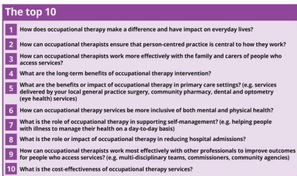
Figure 2: The Top 10 research priorities for occupational therapy in the UK

There were 19 participants in the final prioritisation workshop of the OTPSP; nine with lived experience (one invited individual was unable to participate on the day) and ten from the occupational therapy profession. Together they considered the 18 shortlisted summary questions to reach a consensus and identify the Top 10 research priorities for occupation therapy in the UK, as outlined in Figure 2 below.