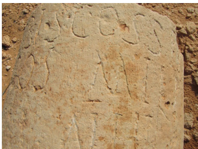
Figure 5. Milestone fragment (top righthand).

column. The text is inscribed on a finely chiselled surface in slightly irregular but elegantly carved capitals. There appears to be a supralineal mark (of abbreviation?) above the N in third line. The edition here is based on a transcription by Professor Elmayer subsequently checked against the photographs.