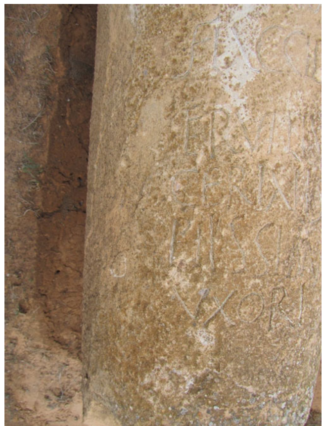
Figure 7. Inscribed limestone column (detail of lines 3–7).

A column of local limestone found on the surface at a location to the west of Beni Walid, not far from milestone n° 1 (no dimensions are recorded). The Latin text is laid out with some care