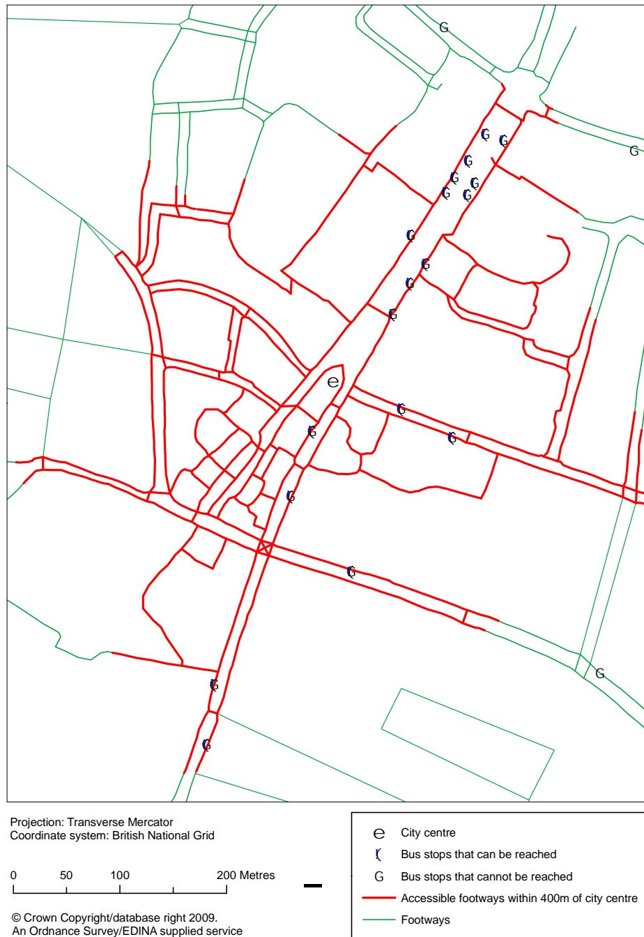
Figure 2. Walk access to bus stops (Younger people).

Using the origin bus stops accessible for a particular group, AMELIA then determines the bus services and the bus stops that can be reached within a certain bus travel time. Footways that are accessible within 400 m of these destination bus stops are then determined. If a certain OA centroid is reachable by these footways then they are mapped