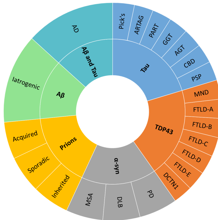
Figure 1: Overview of neurodegenerative diseases associated with misfolded protein aggregation.

The inner circle shows the misfolded protein and the outer circle indicates the disease associated with it. Clockwise from top: Tau (blue): associated with Pick's disease, ARTAG – ageing related tau astrogliopathy, PART – primary ageing related tauopathy, GGT – globular glial tauopathy, AGT – argyrophilic grain disease, CBD – corticobasal degeneration, PSP – progressive supranuclear palsy. TDP43 (orange): MND – motor neurone disease, FTLD-TDP, type A to FTLD-TDP, type E – types of frontotemporal lobar degeneration, DCTN1 – a neurodegenerative disease associated with mutations in the DCTN1 gene. α-synuclein (grey): PD – Parkinson's disease, DLB – dementia with Lewy bodies, MSA – multiple system atrophy. Prion diseases (yellow): aetiologically subdivided into inherited, sporadic and acquired forms. Aβ (green) with no concomitant pathology can be seen in transmitted forms, whilst in combination with tau (cyan) is characteristic of AD – Alzheimer's disease.