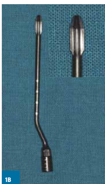
FIGS. 1A, B: Inserts for piezoelectric surgery used in this study: the conical insert with micro-sharp blades (A); the diamond-shaped insert (B).