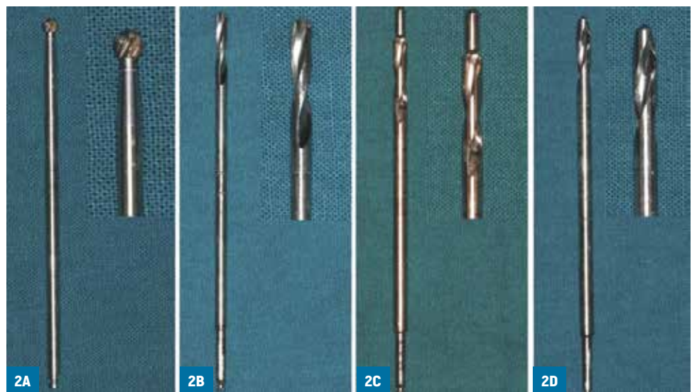
FIGS. 2A-D: Set of drills used in this study in order of sequence of use: zygomatic round ball for initial preparation (A); 2.9 mm diameter pilot drill (B); 3.4 mm diameter countersink drill (C); 3.4 mm diameter drill (D).