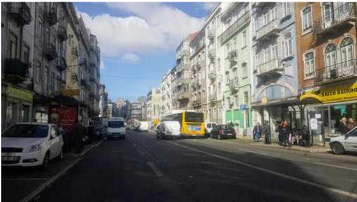
Fig.1 - Aspect of the Lisbon case study street