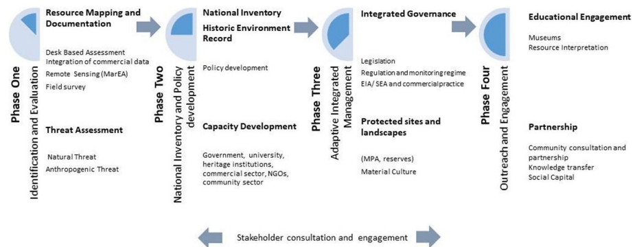
Fig. 2 A conceptual developmental model for how MCH management and capacity could develop in the coming years

Such a baseline assessment could then form the basis of national inventories of sites, monuments and historic landscapes. While many countries across the region have developed such records, data relating to the coastal and underwater environment are often limited or absent. Currently, the maritime cultural resource is little understood across all of these regions. Governments have little input into its protection and management,