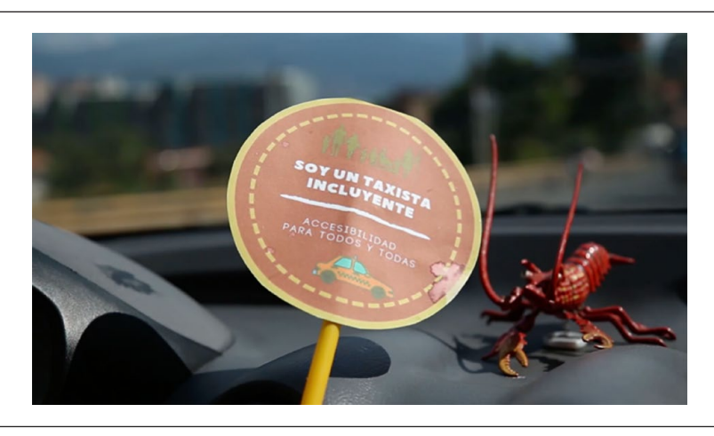
FIGURE 3 "I am an inclusive taxi driver"