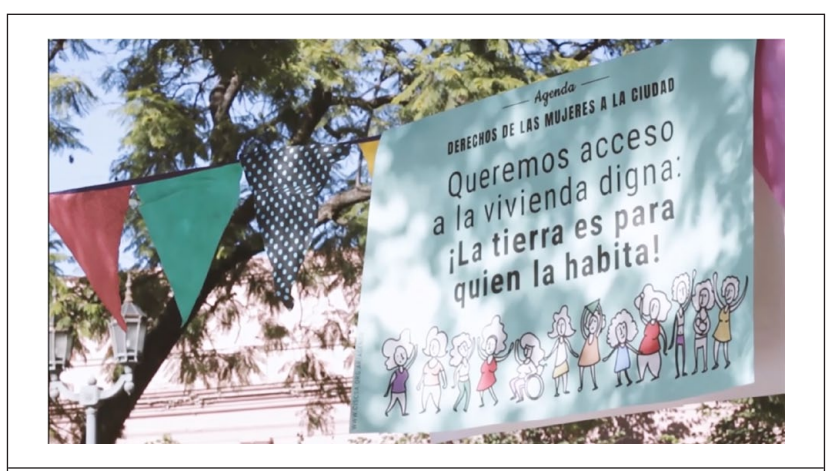
FIGURE 5 "We want access to dignified housing: The land is for those who inhabit it!"