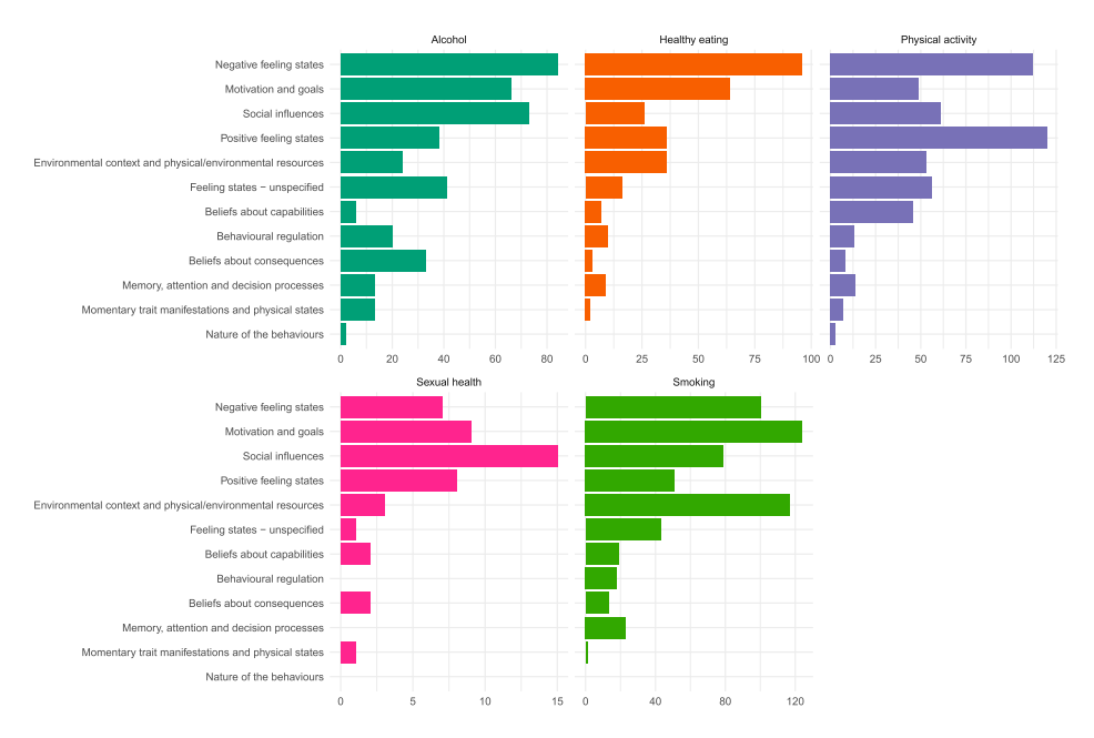
Figure 2. Frequency of psychological and contextual variables assessed using EMA methods, stratified by target behaviour.

Overall, of the psychological and contextual predictors assessed across the included studies, a substantial minority (789/1896; 41.6%) were measured with multiple items (vs. a single item or not reported), with 297 studies (297/633; 46.9%) using solely multiple item-scales to capture psychological or contextual predictors of interest. Of the psychological and contextual predictors assessed across the included studies, just over a third (633/1896; 33.4%) were reported to have been measured with items for which there was a 'precedent' (i.e., items that had previously been used in one or more EMA studies vs. items being developed specifically for the study or the item origin not being reported).