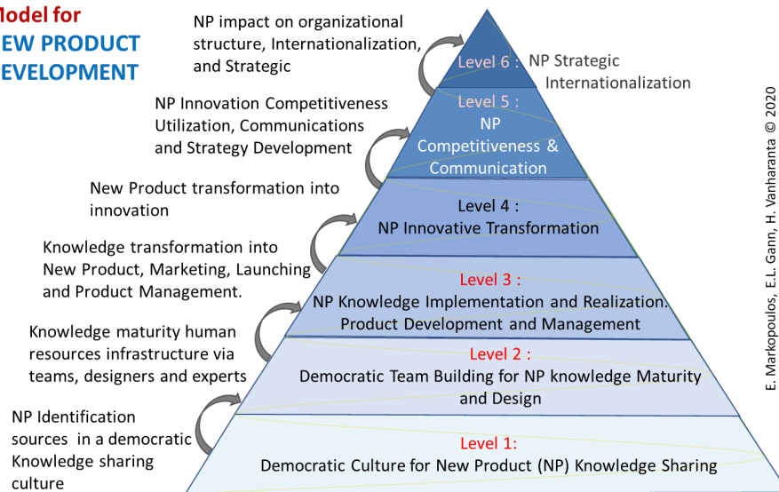
Fig. 1. The Democratic New Product Development Model.