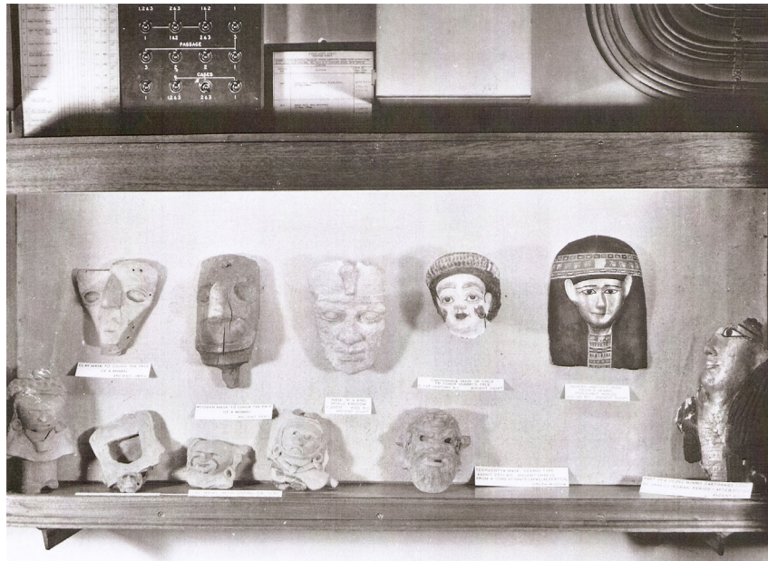
Figure 2. Comparative cross-cultural display of masks, ca. 1956, including three ancient Egyptian examples.