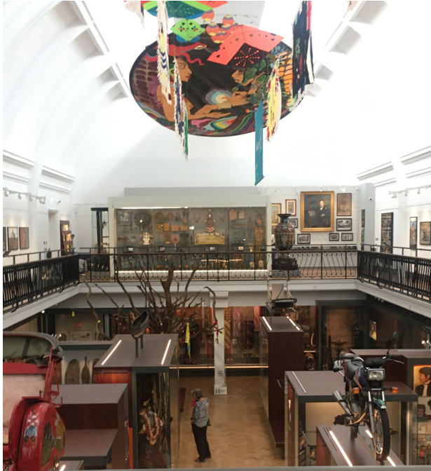
Figure 4. Balcony display on the history of Horniman's collection in the World Culture Gallery, July 2018.

Riggs, for example, has done much to expose the “imperial amnesia” (Fletcher 2012) that characterizes the majority of representations of ancient Egypt, its collection and significance (Riggs 2014). Community consultations and audience research on galleries focused on ancient Egypt, meanwhile, have highlighted a second problematic consequence of contemporary displays: largely negative and dismissive views of modern Egypt amongst Western museum visitors in contrast to the reverence for its ancient (almost exclusively pharaonic) past (e.g., Exell 2015; MacDonald and Shaw 2004, 122–23). In turn, modern Egyptians’ disenfranchisement from representation and from participation in Western Egyptology, together with the taken-for-granted status of their country’s antiquities, has made many Egyptians distrustful of foreign institutions (e.g., Ashmawi 2012; Quirke and Stevenson 2015). But even in a discipline such as anthropology, which has been proactive in addressing similar issues, Egypt’s modernity remains denied and the presentation of material procured under colonial structures sanitized. The historical and contemporary reasons for blind spots can usefully be highlighted with reference to Mason and Sayner’s (2019) examination of “museal silence,” such as those produced because of perceived absences