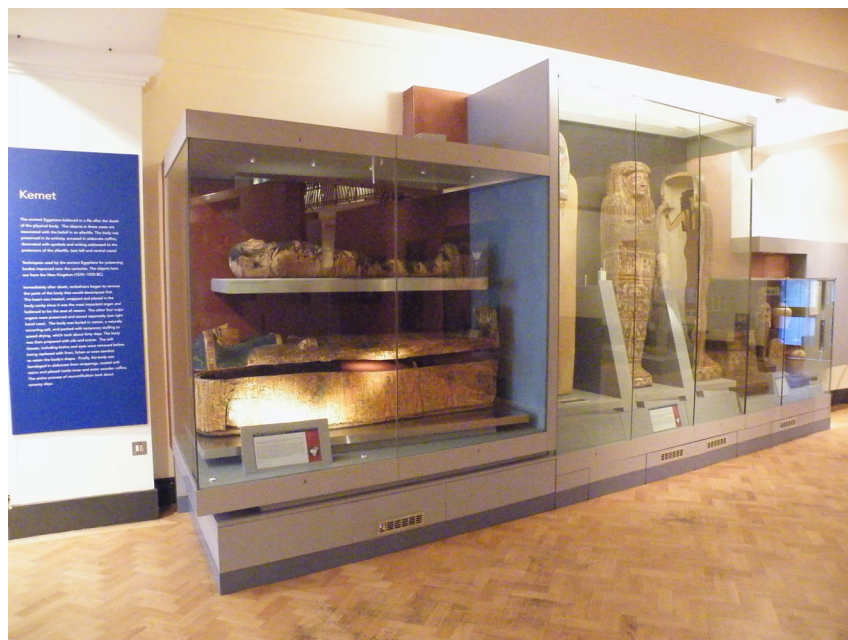
Figure 3. African Worlds Kemet display and interpretation panel, ca. 2012.

These historical patterns of display were replicated in different times and in numerous institutions, drawing variously on the mutability of ancient Egyptian objects (Stevenson 2019). They could be