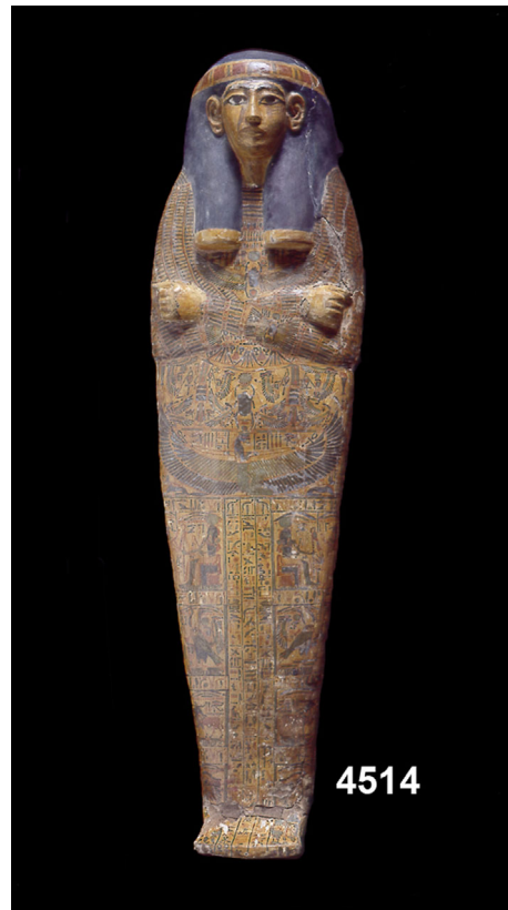
Figure 1. Inner coffin (museum number 4514) presented to Frederick Horniman by the Egypt Exploration Fund after he visited and donated money towards excavations at Deir el-Bahri in 1896. Part of a wider assemblage including a sarcophagus and enclosed human mummified remains.

On Horniman’s return from his world tour, including Egypt in 1896, his acquisitions prompted a redisplay, and Egypt was separated from classical antiquities over two rooms: the Egyptian Mummy Room and the New Oriental Saloon. Here, more than 160 objects from Egypt formed part of the visitor’s conceptual journey across a homogenized “East” through a series of rooms dedicated to India, Ceylon, and Burma (Quick 1898). As a visual expression of Orientalist ideology, Egypt’s inclusion in this narrative built upon the romance and exoticism of the East