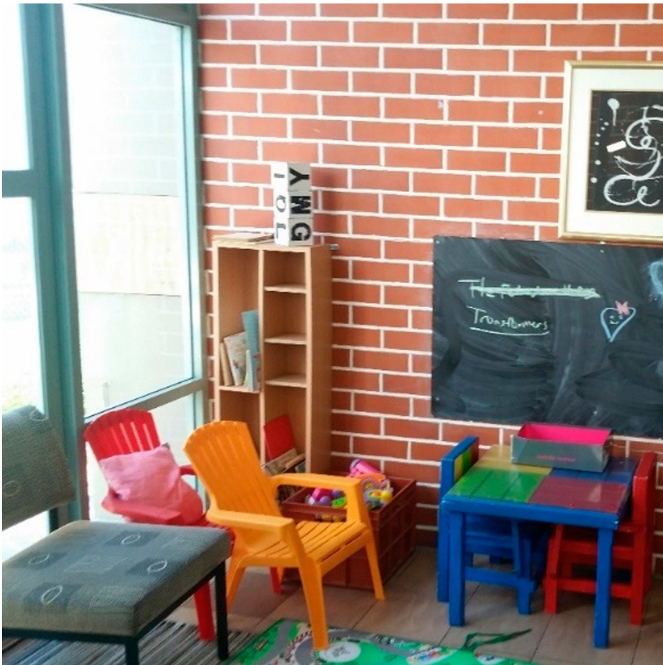
Figure 2. Family/whānau room for a 64-bed facility.

Their reasoning being there are other vulnerable patients who perhaps have been a victim of sexual assault ... And there was a small lounge at the top end of the [female] corridor where I thought you could probably meet there but it still was in the corridor so he [service users' father] couldn't do that. My husband couldn't do that. (C_F_F_NM_3)