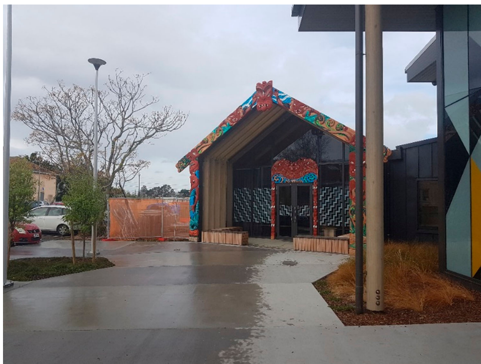
Figure 4. Whare – for culturally appropriate admissions and cultural activities, like waiata (singing) and karakia (prayer).

surfaces dominated the majority of the unit's outdoor spaces, even in the newest facility featuring two modern internal courtyards, nature and greenery were sparse (see Figure 5 ).