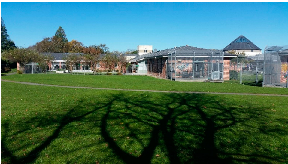
Figure 8. Typical outdoor space on many units.

Similarly, generally unkempt or minimalist landscaping, dilapidated appearance and an overall lack of design reflect the lack of planning, resourcing and care for people at their most vulnerable.