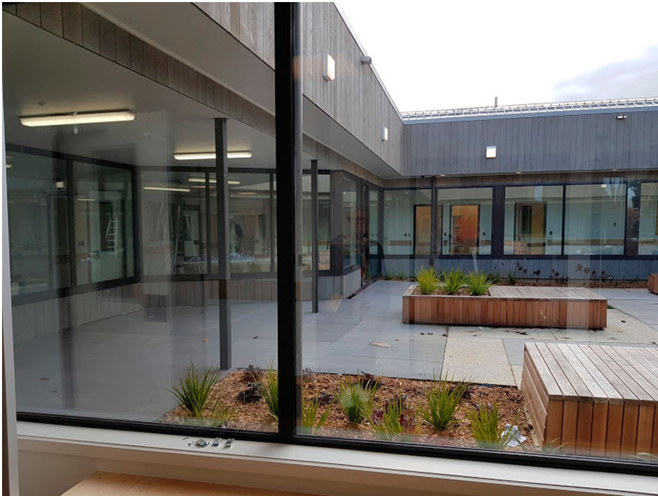
Figure 5. One of two internal courtyards in Unit D.

Accommodation for outdoor activities was also very limited by the basic nature of the courtyards. The predominant way the courtyards were used by service users in three of the four case study facilities, was for smoking and the socialisation that accommodated this activity (Jenkin et al. 2021b). Despite the smoke-free policy in all hospitals, only one acute mental health unit, Unit D, succeeded in achieving a smoke-free environment.