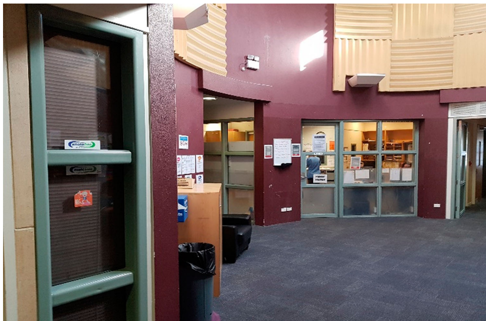
Figure 7. Closed in staff station, Unit B.