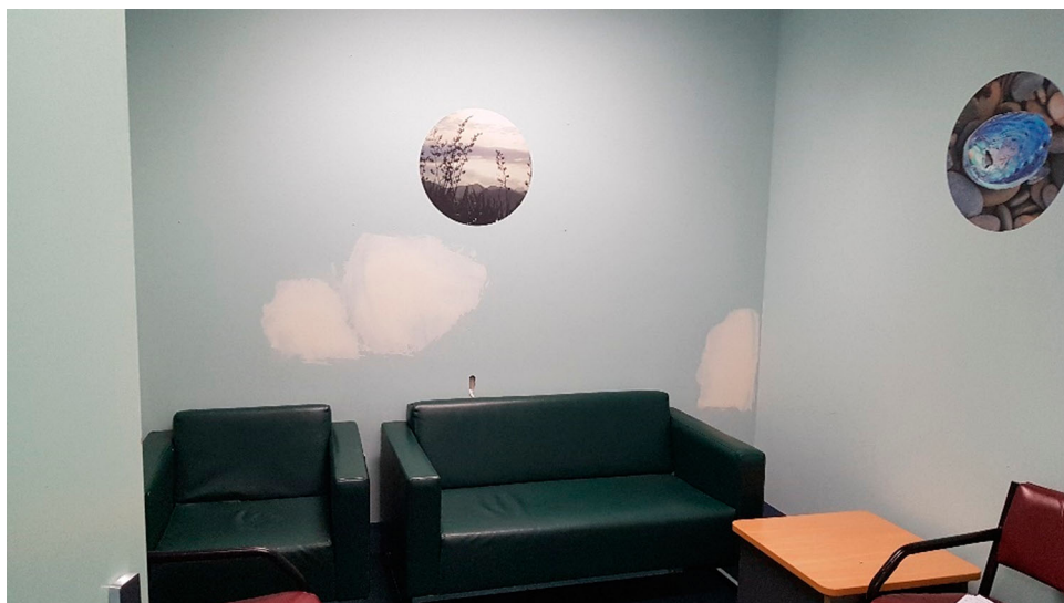
Figure 3. Family/whānau room Unit C.