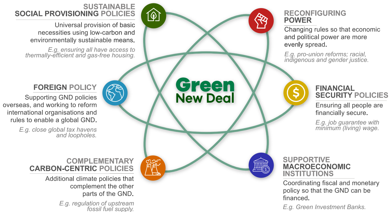
Figure 3. The six clusters of GND policy components

The first three clusters of GND policy components, clockwise from “Sustainable Social Provisioning Policies”, are distinctive of GND programs. The remaining three clusters cover areas closer to the mainstream concerns of the carbon-centric paradigm or address cross-cutting institutions and policies.