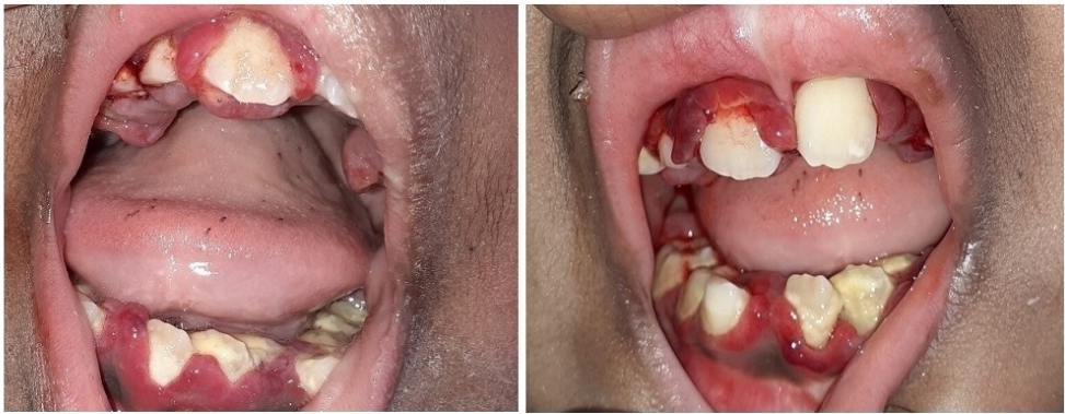
86x64mm (300 x 300 DPI)