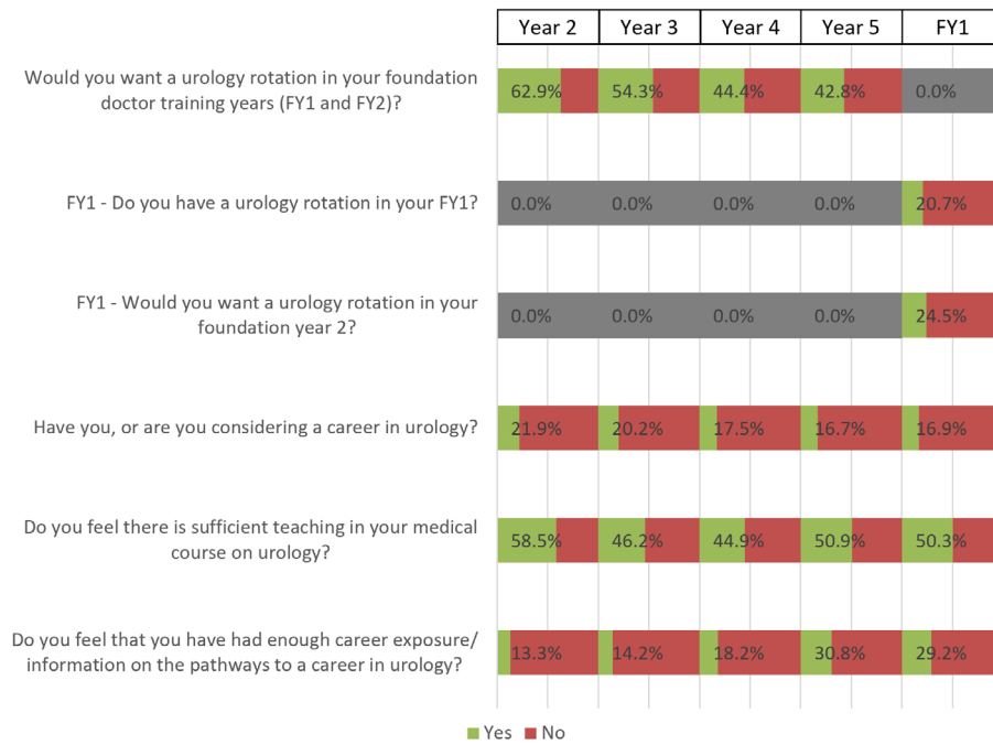
Fig. 3 Postgraduate career and exposure, stratified by year group. Percentage (%) corresponds to the 'Yes' value.

17.3% of all Year 2 to Year 5 medical students and FY1 doctors collectively (7063/40 927). In addition, representation was achieved across all 39 eligible UK medical schools. This enabled us to capture the heterogeneity in placement exposure, both across and within UK medical schools. To our knowledge, this is the largest study on specialty-specific undergraduate teaching. We did not find any comparable large-scale evidence on urology education during medical school in other countries. This makes the LEARN the only study worldwide to investigate this and serves as a good baseline for other countries to investigate their undergraduate urology exposure. Additionally, there was no strong evidence to suggest significant variation in results between medical schools based on the number of responses (Fig. S18). Medical schools with a greater number of responses tended to fall within a reasonable difference to the national average, whilst medical schools with a lower number of responses were at risk of over-estimating urological exposure.