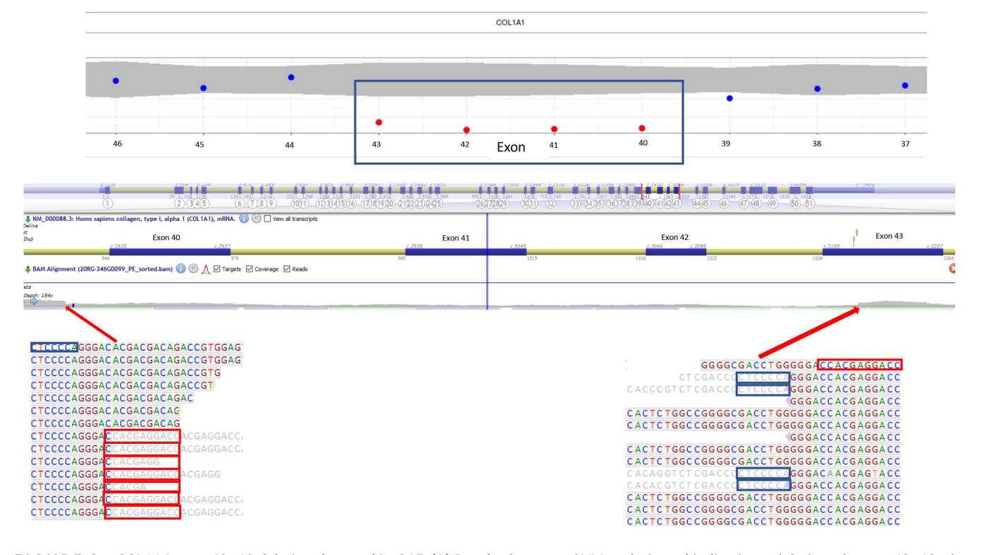
FIGURE 3 COL1A1 exon 40–43 deletion detected in C15. (A) Results from our CNV analysis tool indicating a deletion of exons 40–43 of the COL1A1 gene. The blue dot represents normal copy number and red dot a deletion. The grey area shows the variance in read depth for the other samples on the run. (B) The sequencing reads at the identified breakpoints. The blue box shows the matching reference sequence from intron 39 that can be seen in the reads mapping to exon 43 with insertion of GGGA from the exon 43 sequence in between. The red box indicates the matching reference sequence from exon 43 seen in intron 39, again with an insertion of GGGA. CNV, copy number variant

pipeline. Although in this case the use of inheritance filtering would not have changed the outcome, it highlights an important consideration for mosaicism and the need for manual inspection of parental sequencing reads for all "de novo" cases, as recurrence risks in this case are now high, as compared to a germline mosaic risk. In our second case (C10), the fetus had a lethal phenotype and the mother was subsequently diagnosed with mild features when examined by a clinical geneticist when returning the ES results. Asymptomatic parents may be a somatic mosaic for a pathogenic variant with a variant allele frequency (VAF) high enough to be called by a variant caller, but these variants may then be filtered out if the inheritance does not fit that expected based on the family history and clinical information available. In the prenatal setting this is especially important to consider for conditions such as osteogenesis imperfecta, which often presents prenatally and for which mosaicism<sup>20,21</sup> and variable expressivity<sup>22,23</sup> are common and have been reported previously.<sup>4,24</sup> It is therefore crucial that mosaicism is considered when designing pipelines and cut-offs for VAFs, although this will highly depend on the quality of the sequence data and will often not be straight forward.