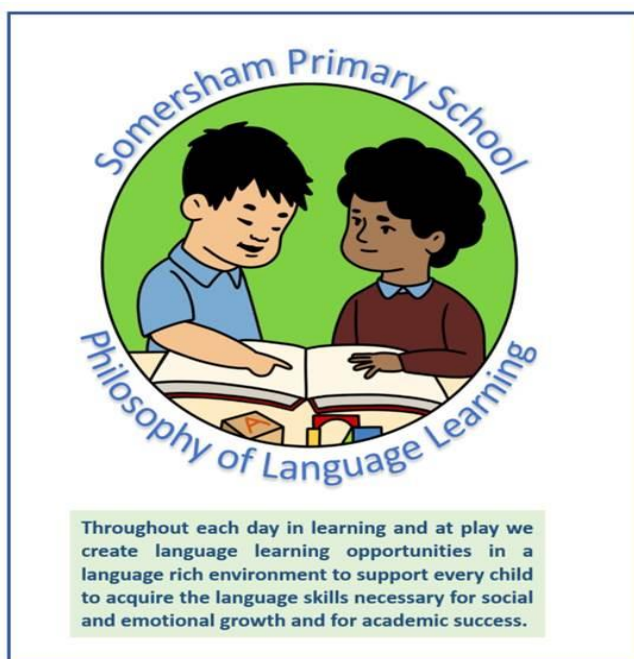
Figure 3 – The Philosophy for Language Learning logo and message

‘We aim to enable our children to have the confidence to approach social situations with a mature, well-rounded focus and express their wants, needs and emotions in a constructive and well-mannered fashion. We strive for our children to become happy learners who can understand the world around them and comprehend their actions and the consequences of these. Our aim is to provide a structured approach to teaching these important factors to give children the best possible advantages for continued growth.’