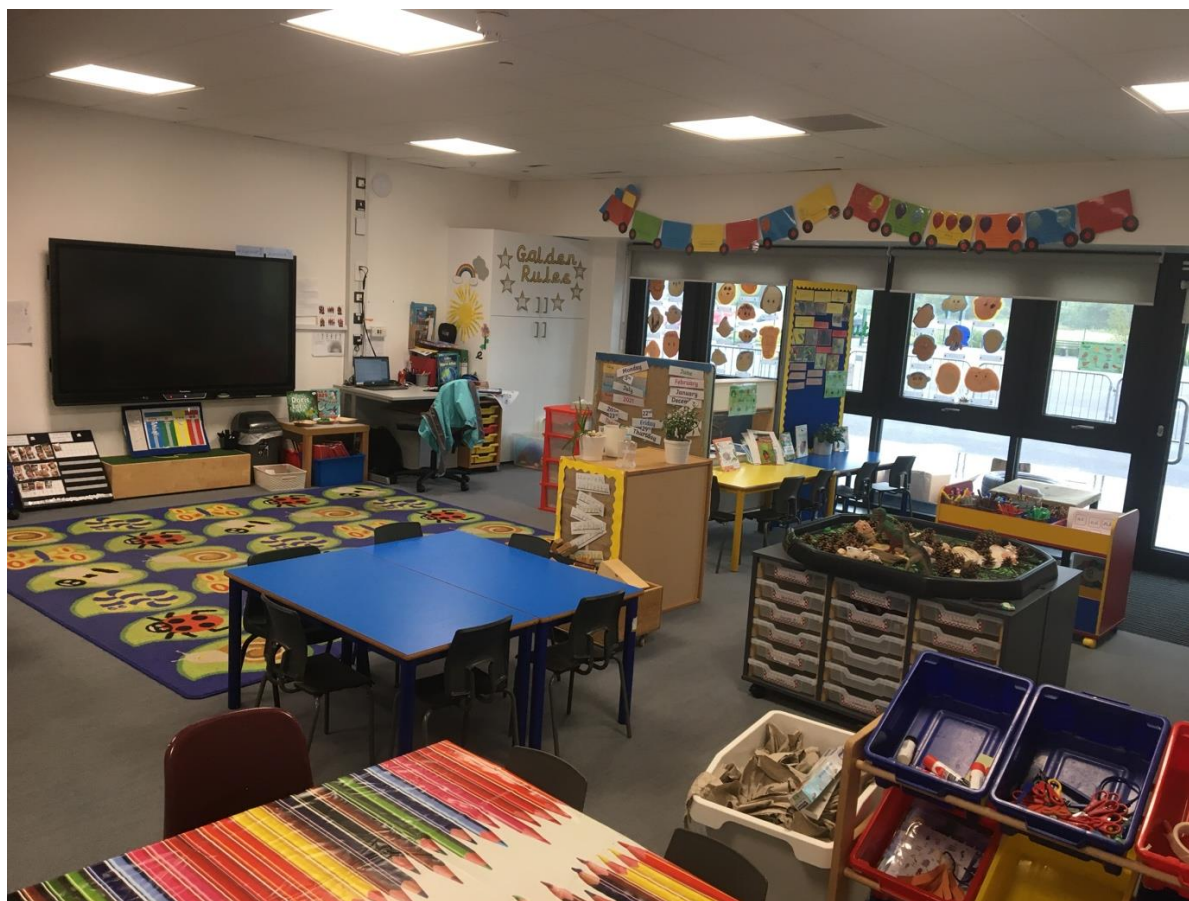
Figure 1 – One of the EY classrooms at the Histon and Impington Infant School

Some other areas of development were also identified. For example, it was noted that children did not have opportunities to choose activities or engage in interactive book reading. It was also noted a lack of interaction with male teachers or teaching assistants, which are not employed in early years – a common issue within CPET due to a lack of male applicants.