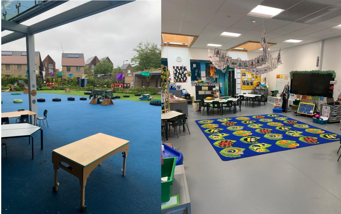
Figure 2 – the exterior and interior learning environments at Trumpington Park Primary School