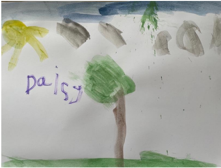
Figure 4 – A sunny day by Daisy at Somersham