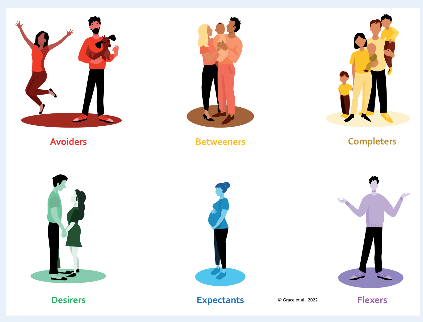
Figure 2. The ABC of reproductive intentions.

graduates and non-graduates. They felt that the timing was important in order to try for a baby. In order to plan for pregnancy, they were talking to their healthcare professionals, taking the right vitamins, taking care of their health, and timing conception to maximize chances.