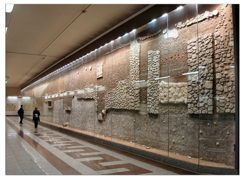
Figure 2. Example of human modified ground in section, as it was cut through during construction of the Syntagma Square metro station, Athens, and preserved in situ in the station concourse. Note how the section contains physical traces of many past events which have taken place over the last few thousand years—including the digging and backfilling of pits, the building of walls, the laying of floors and drains, and even the construction of the metro in the 1970s.

Historical relationships between human and environmental processes can also be documented with paleoenvironmental proxies in sedimentary contexts, such as chemical signatures recorded in ice cores or speleothems, as well as floral and faunal remains in marine, fluvial, aeolian, colluvial or lacustrine deposits. Such depositional records can equally serve as a basis for identifying the diachronous effects of humans on local to global environmental processes. For example, the domestication of plants, human-assisted dispersal of domesticates and commensal species, and widespread deforestation in premodern periods is evident through the aggregation of hundreds of lacustrine pollen sequences that collectively demonstrate a reduction in forest taxa and an increase in non-arboreal or agricultural indicators across whole continents in a process that took place over millennia (e.g., Fyfe et al., 2015). Paleobotanical records can stand independently as evidence of human impacts (e.g., through the recognition of 'disturbance' taxa [Behre, 1981; Scharf, 2010]); however, these interpretations are strengthened when related to other forms of contextual data, such as independent archaeological evidence for the expansion of settlement or new land-use practices. For instance, floral and faunal remains