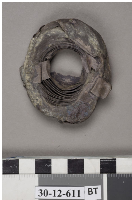
Figure 3. Rolled-up silver hair ribbon.

object number 30-12-611.