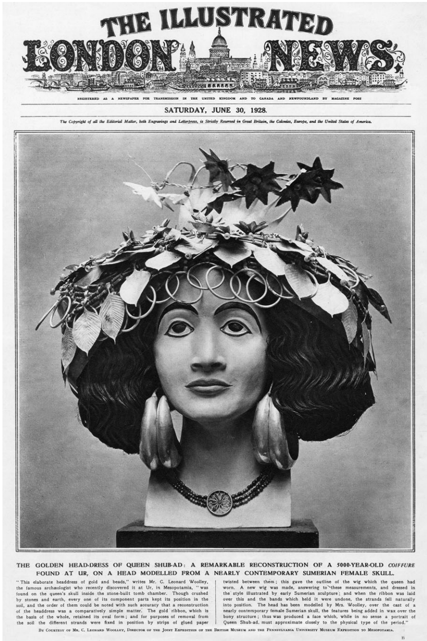
Figure 2. Queen Puabi's reconstructed head and headdress on the front page of The Illustrated London News , 30 June 1928.