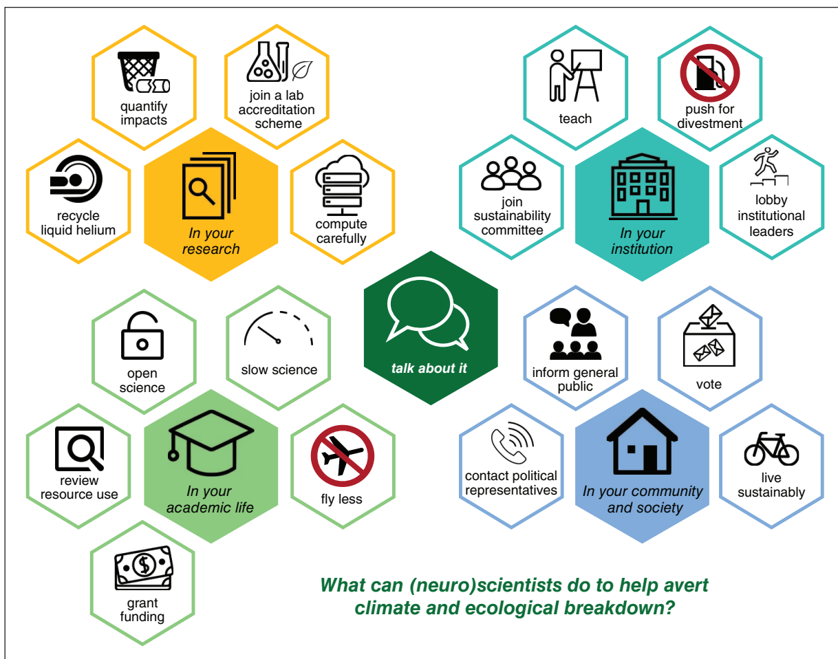
Figure 1. Ways in which (neuro)scientists can act on the climate and ecological emergencies. We distinguish four areas of influence and a non-exhaustive list of specific actions, each of which is discussed in greater detail in the article.