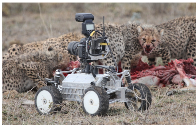
Fig. 1. A cheetah cub being disturbed at a kill by an amateur photographer’s use of a remote camera in a National Park in Tanzania.

Negative interactions between humans and wildlife are at the crux of many conservation issues, with human-wildlife conflict recognised as a leading threat to terrestrial large carnivores (Ripple et al., 2014). Careful consideration should be given before showing people in close proximity to, or interacting with, wildlife. For example, in the BBC Dynasties series, during the African wild dog ( Lycaon pictus ) episode (episode 4: Painted Wolves), the ‘life behind the lens’ feature (in this case called ‘Dynasties: on location’) showed