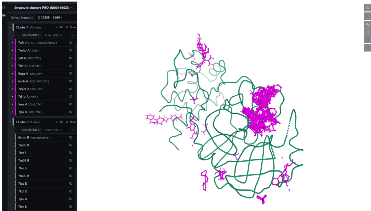
Figure 2. Superposition of protein chains and ligand molecules. The aggregated views of proteins provide access to superposed protein segments and offer a display mode that overlays all the observed ligands on representative chains from superposition clusters. The figure displays the ligand superposition of all the available small molecules in PDB structures of the 3C-like proteinase nsp5 of SARS-CoV-2.