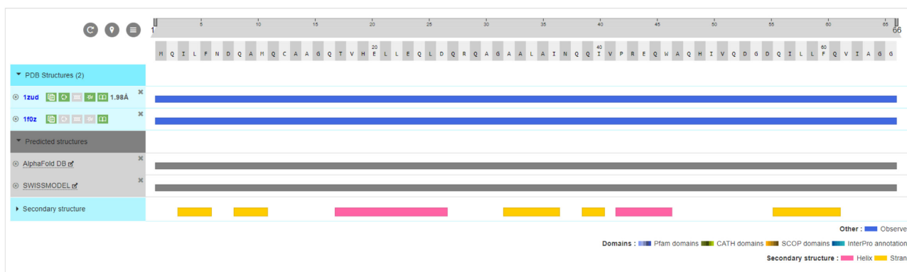
Figure 5. Predicted models of a protein of interest. The aggregated views of proteins now provide an overview of available predicted models from data resources such as AlphaFold DB and SWISS-MODEL.