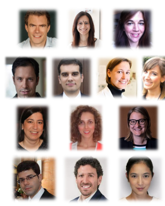
Figure 3 EMEUNET chairs from 2009 to 2021. EMEUNET, EMerging Eular NETwork.

to the involvement of EMEUNET in the newly launched EULAR Virtual Research Centre. <sup>25</sup> In addition, the possibility to have EMEUNET representatives in each of the EULAR content committees, that is, Advocacy, Congress, Education, Quality of Care and Research), as set out in the new EULAR bylaws, will be an incredible opportunity for EMEUNET to help shape the future of the EULAR family.