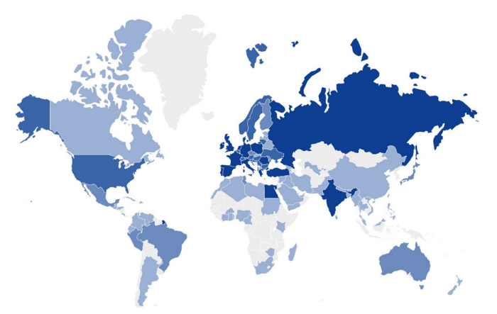
Figure 1 EMEUNET members worldwide, ≥51 members-; 21-50 members-; 11-20 members-; 1-10 members-EMEUNET, EMerging Eular NETwork.

While blowing out our first 10 birthday candles,<sup>22</sup> we kept strengthening the bond with EULAR, which lead