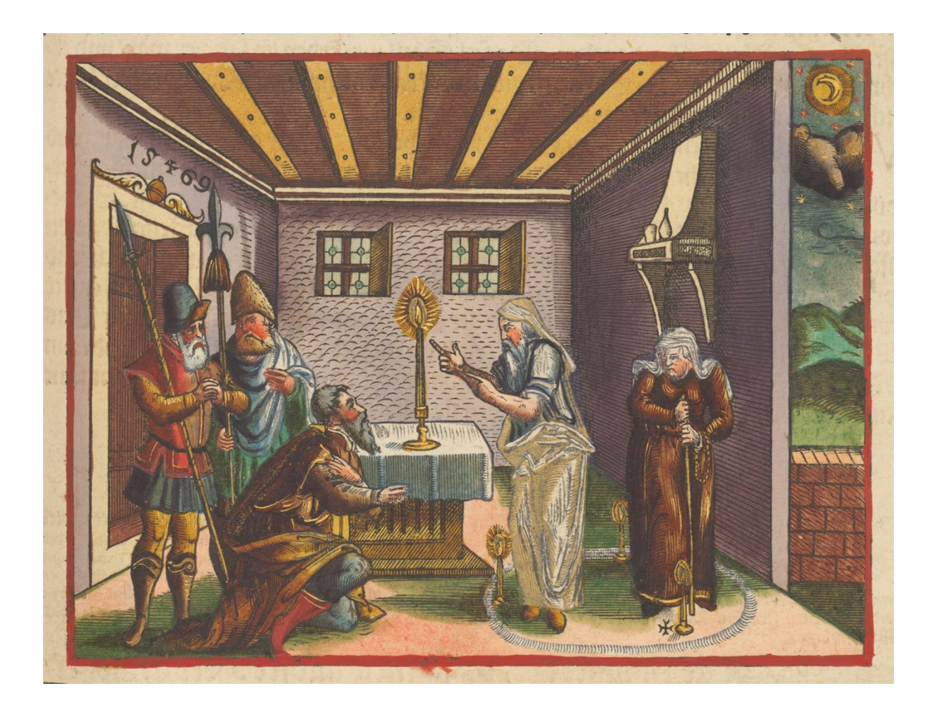
Figure 2. The woman of Endor as a ritual magician in a woodcut from the 1572 Wittenberg edition of the Luther Bible. Biblia Das ist: Die gantze heilige Schrifft Deudsch. D. Mart. Luth. , Wittenberg [Hans Krafft], 1572, p. 197.

thus emphasising the malign character of the woman of Endor and the demonic nature of Samuel's apparition.