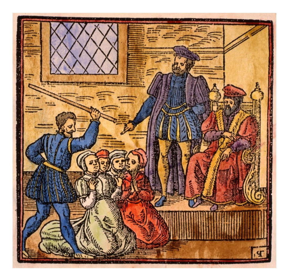
Figure 1. Suspected witches are threatened in front of two magistrates in a woodcut printed in Newes from Scotland . The seated man was commonly, and erroneously, identified as King James VI.

the privy council, examined the suspected witches and authorized the use of torture. All of them were found guilty and sentenced to strangling and burning.