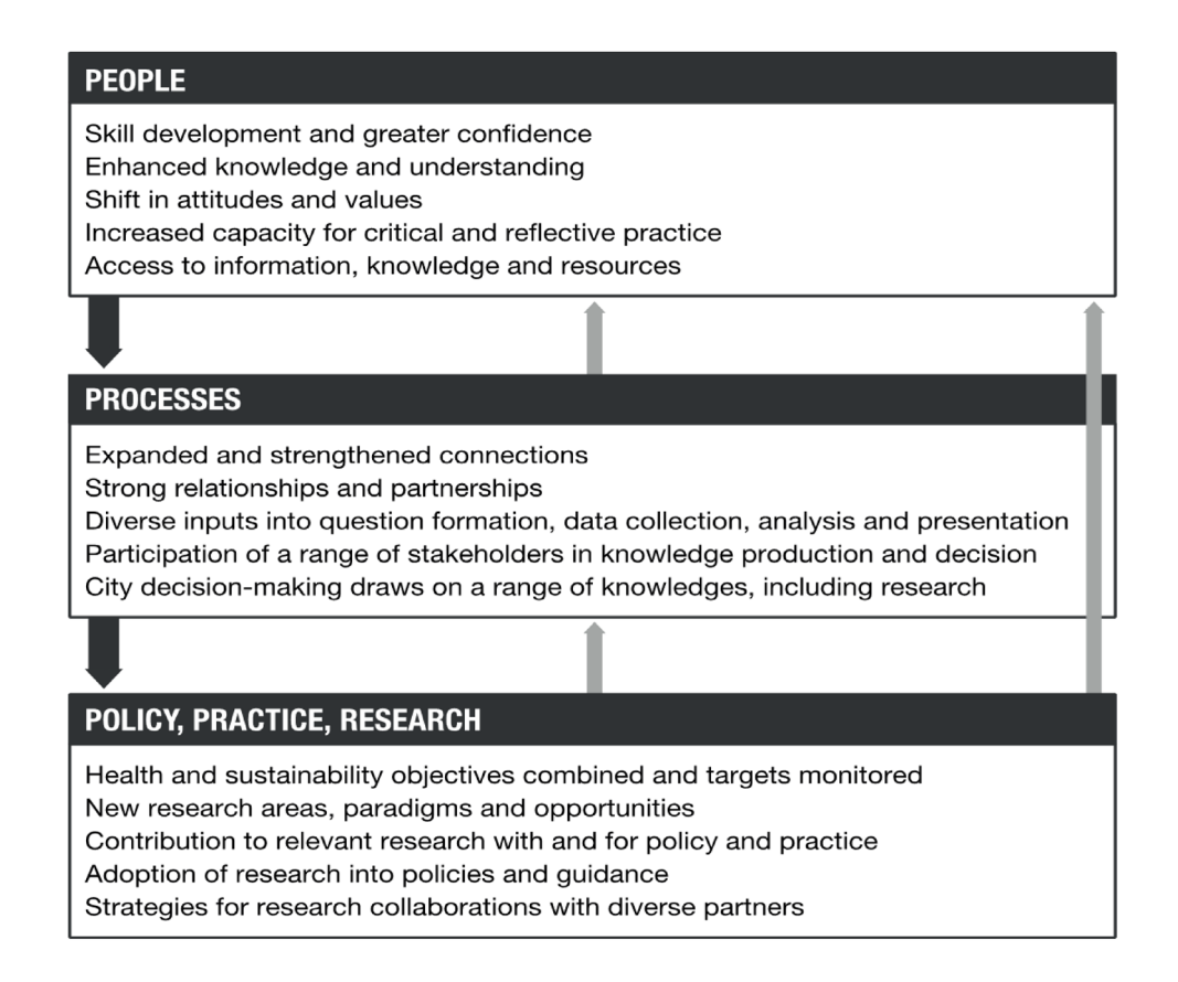
Figure 2. Change model for Complex Urban Systems for Sustainability and Health ('CUSSH'). Dark arrows are feed-forward. Light arrows are feedback.