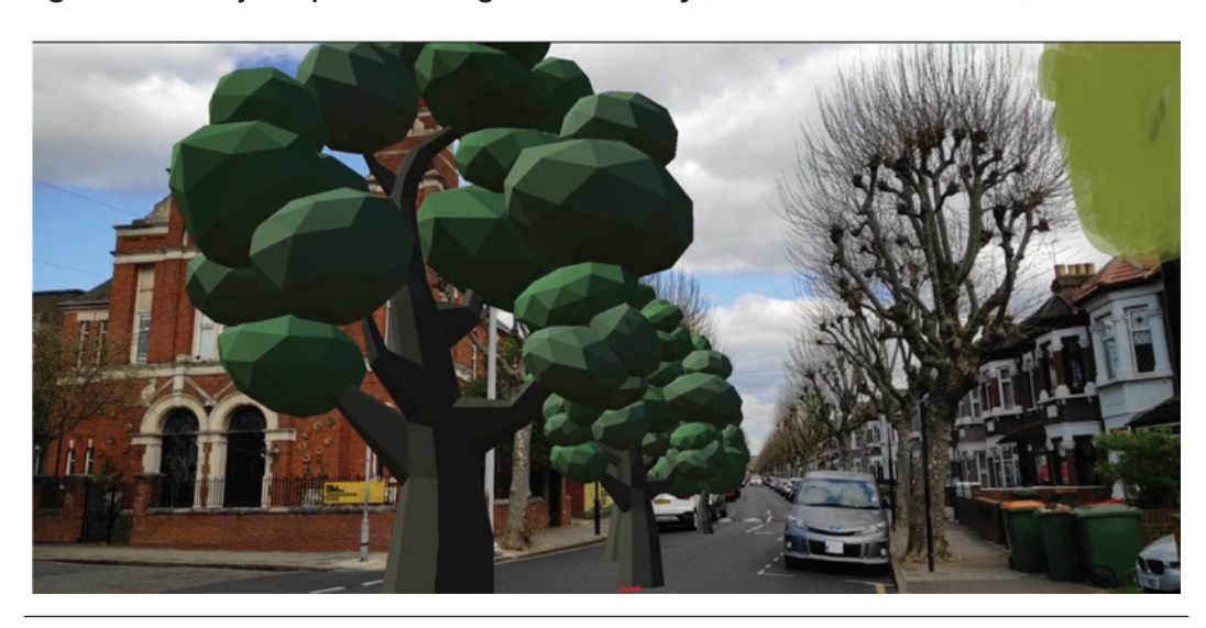
Figure 6: 3D objects placed in augmented reality