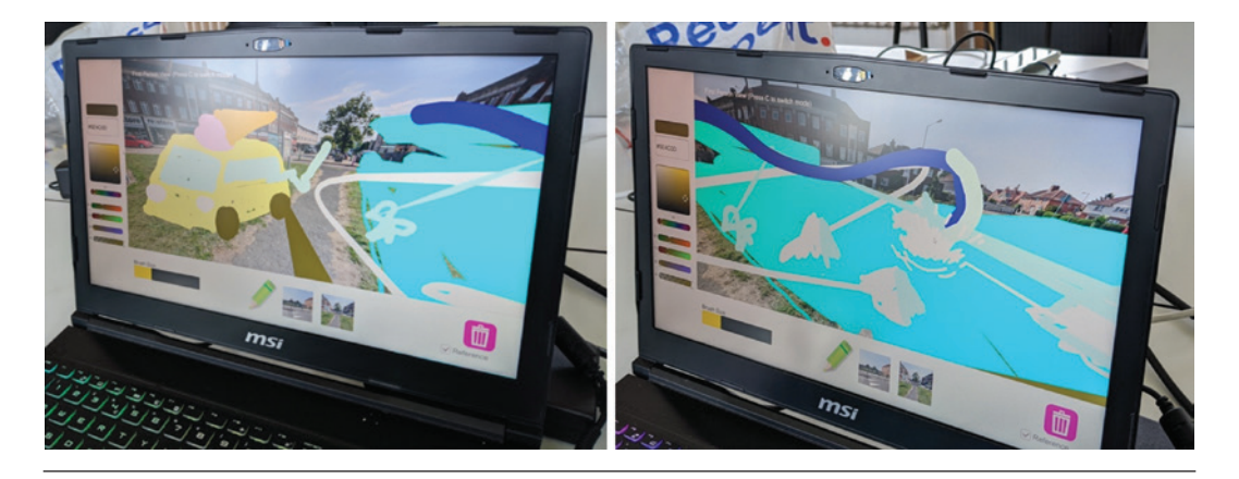
Figure 7: Andy Council testing the 3D drawing software, Filwood Broadway, August 2020

We used prompts in our facilitation script to guide the conversations. Some of these provocations urged participants to engage with social and civic challenges or to