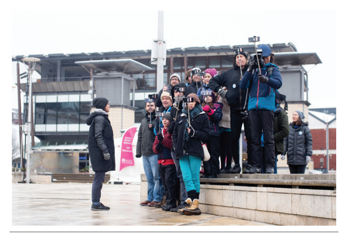
Figure 1: Billennium, Uninvited Guests and Duncan Speakman, Layered Realities, Millennium Square, 2018

Billennium premiered in Bristol's Millennium Square in 2018, having been commissioned by Watershed Media Centre and the University of Bristol's Smart Internet Lab for their Layered Realities 5G Platform (www.watershed.co.uk/studio/projects/ layered-realities), which showcased potential innovative and creative applications of 5G connectivity to the public (see Figure 1). Billennium is a theatrical guided tour, not of historic sites, but of a city's futures, on which participants walk through time to the locations of utopian and dystopian science fictions. Future architecture appears before participants' eyes, and they hear what different worlds might sound like. Accompanied by performers as archaeologists of the future, participants carry mobile devices that interpret and visualize traces of what is to come (see Figure 2). The tour concludes with an opportunity to design tomorrow's city together and see the imagined buildings layered onto the architecture of today using augmented reality (see Figure 3). Livestreamed, multichannel audio immerses participants in science-fiction location sounds, and speculative architecture is drawn in real time over the existing buildings.