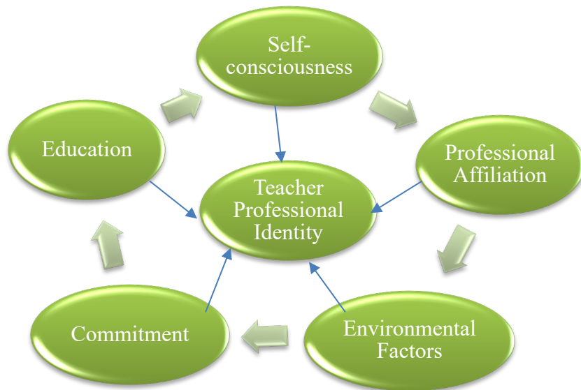
Figure 1. Conceptual framework of Teacher Professional Identity (Researcher).

Considering the complexity of the construct of TPI, it seems reasonable to suggest that any meaningful investigation of it has to be contextual or situation-specific. The figure (2) below identifies the factors that influence TPI in the Nigerian context. I constructed this model from key readings in the literature.