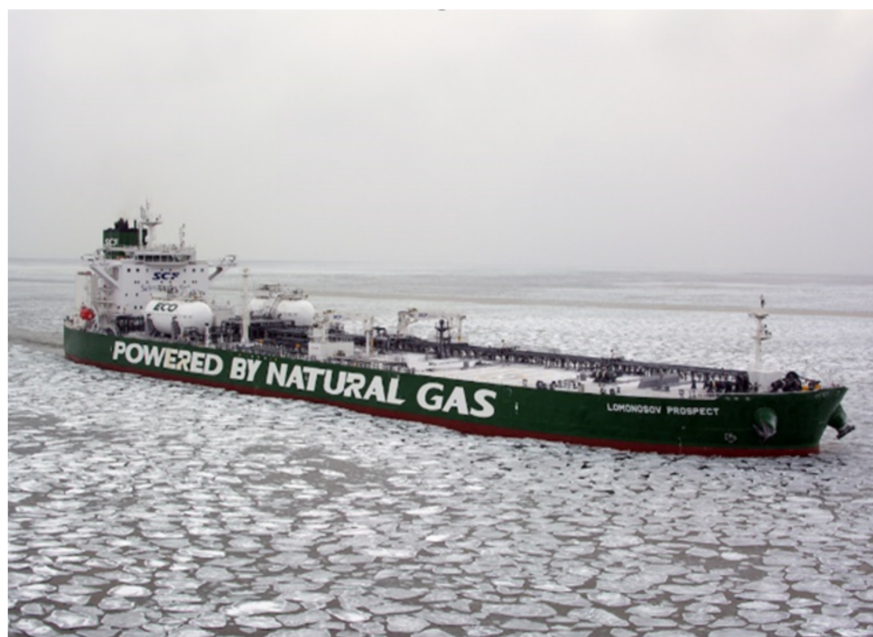
Fig 1: A ship operating in ice floes.

With the effects of global warming, the Arctic is presenting a new environment where numerous ice floes are floating on the open sea surface. Compared with continuous level ice that used to dominate the region, the ice floe condition has improved Arctic shipping navigability by allowing non-icebreaking ships to operate, as shown in Fig 1, opening many significant shipping routes and access to abundant Arctic natural resources. However, the interaction of such floes with ships is yet to be understood to aid the designing of ships and route planning.