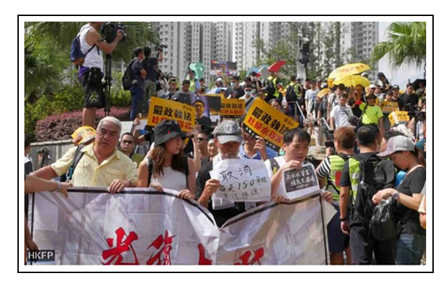
Figure 7. Street protests against, among other things, the impact of parallel trading in Sheung Shui in Hong Kong northern district.

do parallel trading. In the afternoon, around 4pm, my husband picks up my son from the kindergarten. I wait for them at the border at around 5:30pm, then we go home together happily. Every day is the same. We also have some pressure. But our advantage is that we do parallel trading and have more free, flexible time. Many couples need to go to work. They are very tired.