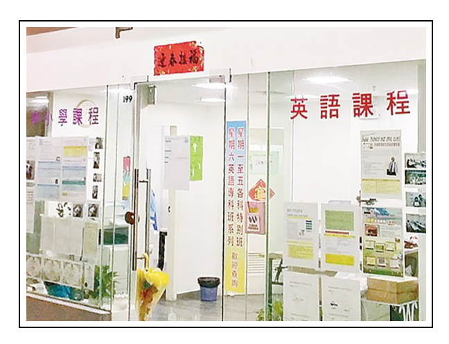
Figure 5. A 'Hong Kong style' tutoring centre in Shenzhen.

commonly practised among children in Hong Kong, visit tutor centres after school. The difference in instructional languages poses a challenge to many CBS. While English and Cantonese, written in traditional Chinese characters, are used in Hong Kong, simplified Mandarin Chinese is used on the Mainland.<sup>5</sup> Special tutoring services have become a niche and booming business on the Mainland side of the Shenzhen-Hong Kong border. Tutor centres range widely in size and offerings. Some also offer extracurricular courses in music, art and sports. Regardless of the content, 'Hong Kong style' or 'Hong Kong approach' is the core selling point. This business model has an imprint on the urban landscape. Advertisements, written in traditional Chinese characters and often also in English, on the shop fronts or on easy pull frames placed on sidewalks can be found commonly in certain residential neighbourhoods in Shenzhen (Figure 5).