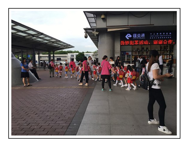
Figure 4. Nannies, in pink tops, at work herding CBS to board the school bus on the Shenzhen side of the border.

regulate, in detail and with heavy responsibilities, where, when and for how long children should be in the midst of the varied and changing urban hustle-and-bustle - considering the different traffic directions, regulations and social rules, cultures, etc. - on both sides of the border and through the border. Being a nanny is demanding. Their work often starts as early as 6am to escort the first group across the boundary to school. Many of them repeat their journeys both in the morning and in the afternoon. Bearing the responsibility for dozens to hundreds of young children – many nannies escort several rounds of children every morning and afternoon, they have to be very alert and vigilant. Under extreme weather conditions such as high summer temperatures, heavy rain or a typhoon, the challenge of bringing these children to school and home in 'good shape' intensifies.