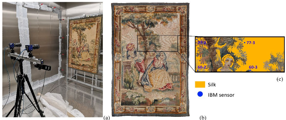
Figure 1. (a) DIC camera setup inside the environmental chamber (b) Front view of the tapestry (c) Area selected for DIC analysis and distribution of IBM sensors.

The 19 th century tapestry was initially analyzed with an electronic microscope where fiber identification showed this tapestry warp as linen and weft a mix between wool and silk threads. The tapestry was hung in an aluminum frame inside an environmental chamber (Figure 1 (a) and (b)) and conditioned to a temperature (T) of 25°C and 45% of relative humidity (RH) prior to testing.