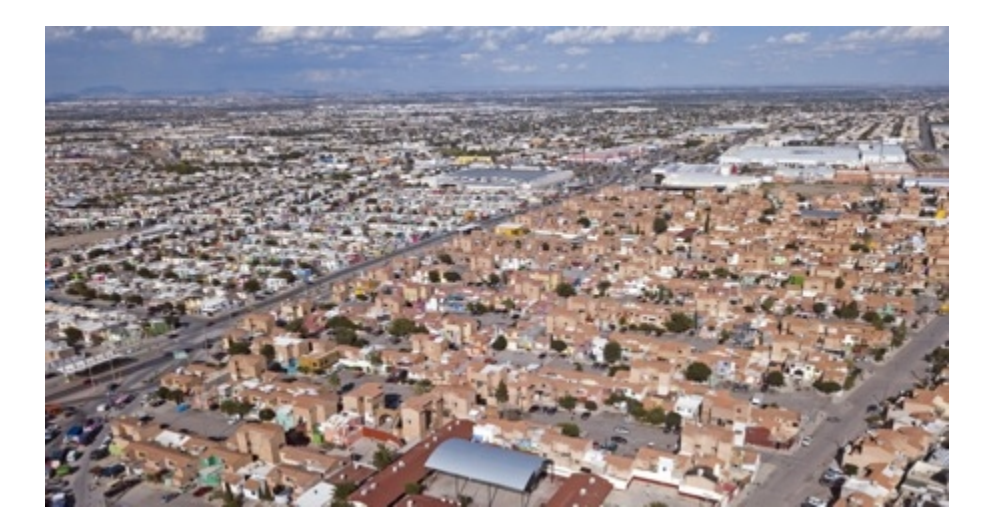
Figure 2. Public housing scheme in Ciudad Juarez