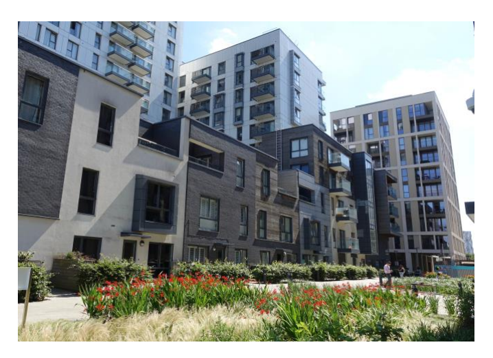
Place Quality delivers Place value

In recent years, the evidence base linking better place design with value (broadly defined) has grown strongly. The very large majority of evidence now points in the same broad direction, that better place quality adds value economically, socially and as regards health and environmental outcomes. The impacts of place are profound, contribute benefits to society over short, medium and long-term time horizons, and reverberate throughout the lives of citizens across all socio-economic strata and globally.