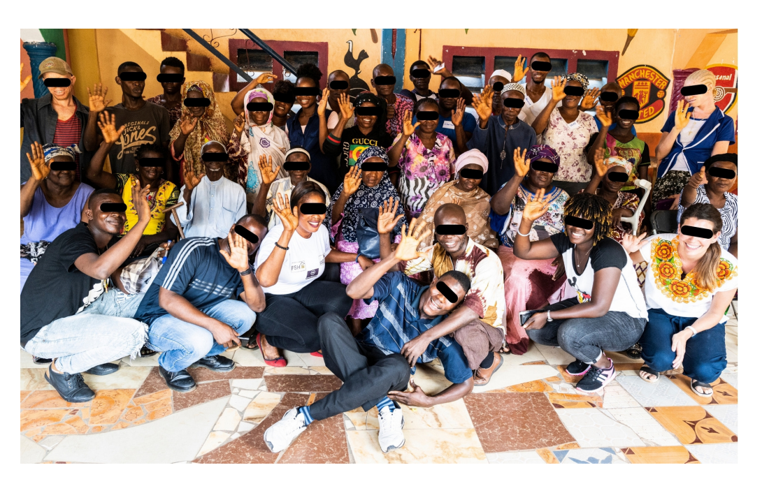
Figure 3. Dworzark Community, FEDURP data collectors and UCL research team after meeting together to talk about AT and disability issues the Community Center, November 2019.

(Participant at Disability Celebration Day, TB)