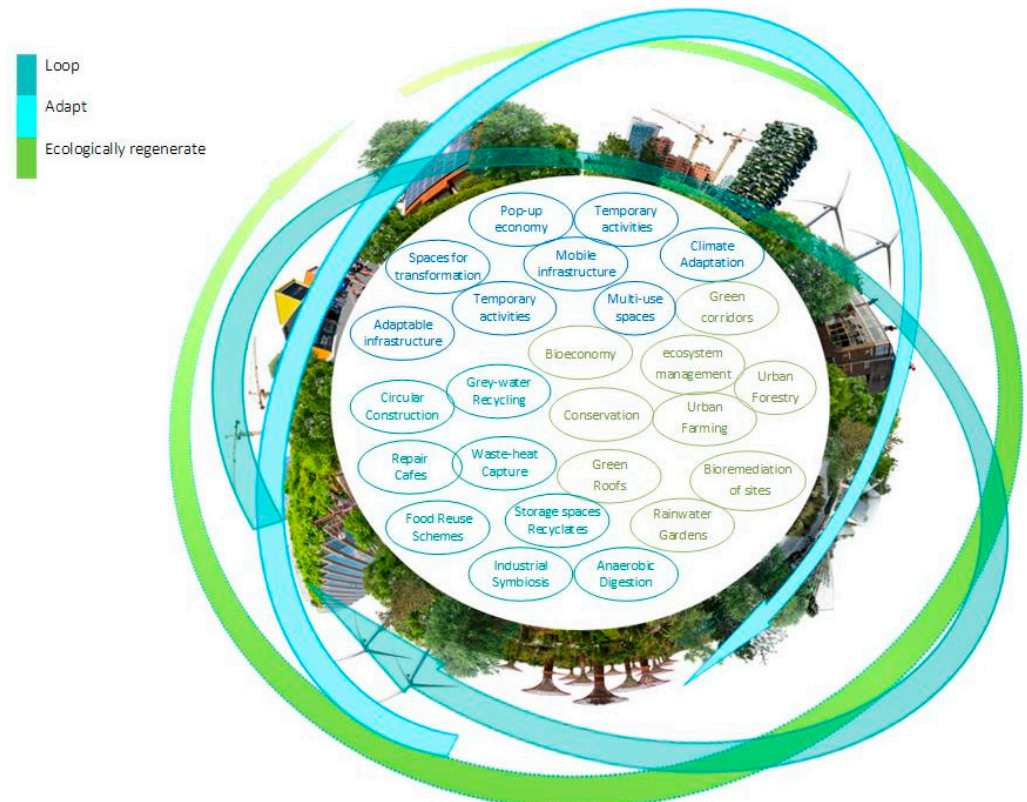
Figure 1. Circular development.

In circular cities, three actions—resource looping, adaptation and ecological regeneration—are implemented in combination to deliver circular development. Figure 1 illustrates some of the processes, activities and material manifestations of circular development in cities. Resource looping (reuse, recycling and recovery) is encouraged through the provision of circular infrastructural systems (e.g., gray-water recycling systems, recyclable infrastructure) and the introduction of new circular processes (e.g., conversion of organic waste to energy, biochemicals or feedstock) in cities. Urban form may also alter to accommodate these new activities, for example through the provision of space to store recyclates or reusable objects. Changes in local systems of provision (e.g., local food banks, recycling websites, repair workshops) also encourage urban inhabitants to reuse and recycle resources.