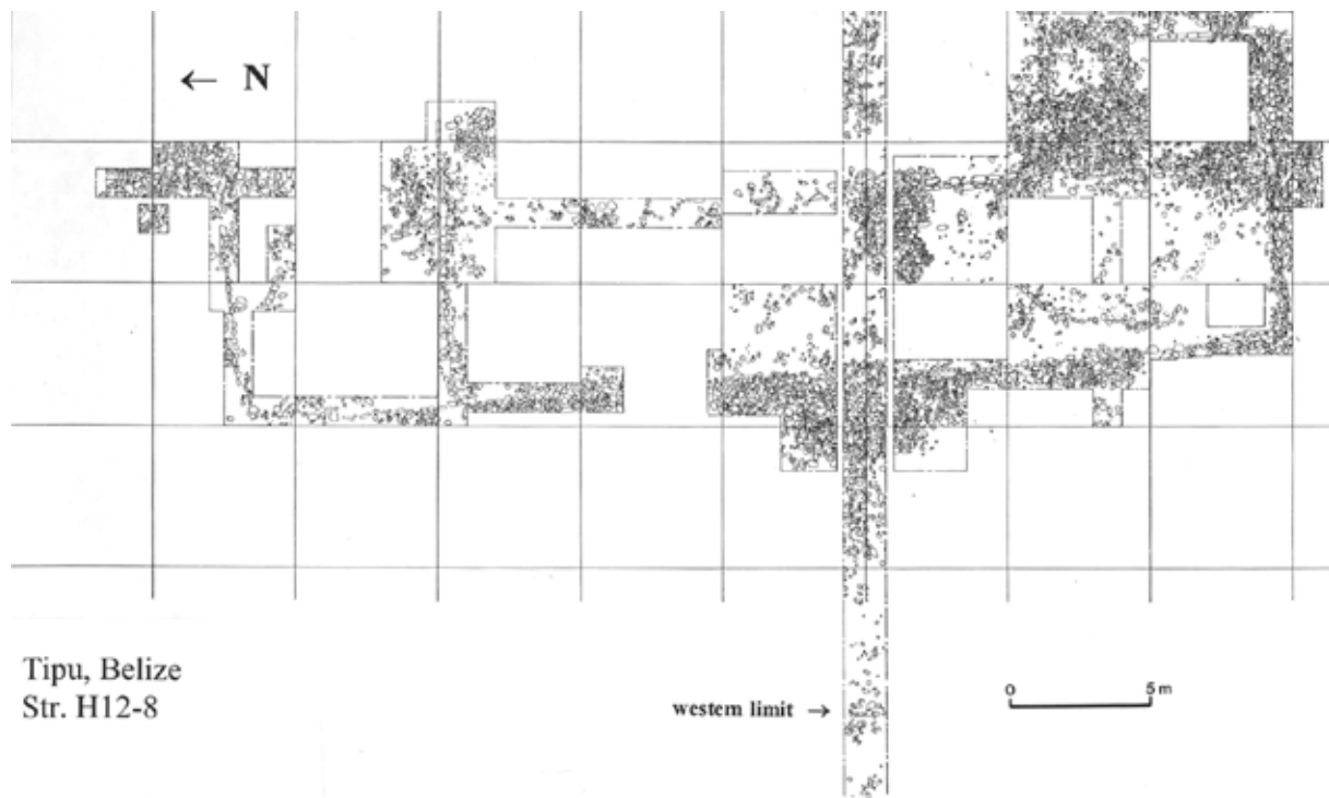
Fig. 3. Plan of one of the structures at Tipu, Str. H12-8. Time permitted only partial excavation, but the overall plan was delimited, and the pattern of stones suggests that the wooden building or buildings that stood here comprised roofed-and-walled space, roofed-and-unwalled space, and open spaces with prepared surfaces. (Drawing by J. Gerhardt)