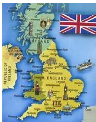
Figure 1: The United Kingdom of Great Britain & Northern Ireland

The journey to school autonomy in England started during the late 1980s and almost certainly because of neoliberal policies being exhibited by the Conservative government in the previous decade under the leadership of Prime Minister Margaret Thatcher. Before embarking on how that story unfolded, however, it is important to recognise that a total of four national school systems exist within the United Kingdom as both Northern Ireland and Scotland have their own regulations, whilst Wales has devolved powers which allow for different policy enactments. It is also necessary to understand that legitimacy is given to independent fee-paying schools which account for some seven per cent of the relevant student population (i.e. those of compulsory education ages – currently 5 to 18 years). This paper only explores what has happened (and continues to happen) in state-funded schools in England.