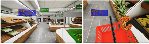
Figure 1: The custom virtual supermarket environment, in which WM tasks were carried out, and player interaction with this environment.

In the initial phase of the work, a fixed difficulty framework was implemented for both the WM and EM tasks consisting of three difficulty levels (easy, medium and hard). This was designed with the purpose of eliciting a range of emotional responses from study participants and, thus, generating a balanced dataset. These difficulty levels differed in the cognitive load required from the participant (e.g. shorter/longer shopping lists in the supermarket, less/more display locations to remember in the museum).