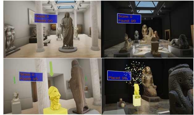
Figure 2: The custom, multi-room, virtual museum environment, in which EM tasks are carried out. More rooms are unlocked as the difficulty level increases. Green arrow markers indicating which displays are to be remembered during the encoding phase. Bottom right: visual feedback for correct answer during the retrieval phase.

3.1.1 Working Memory Task. The goal of the WM task is to find a (randomly generated) array of products in a virtual supermarket (see Fig. 1), placing each product in a shopping basket. The products