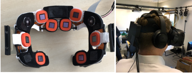
Figure 3: Prototype Faceteq sensing HMD foam insert and how it is placed in the HTC Vive.

displays have been interacted with, the game transitions to the retrieval phase removing the marked displays from the museum, and teleporting the player back to the museum entrance.