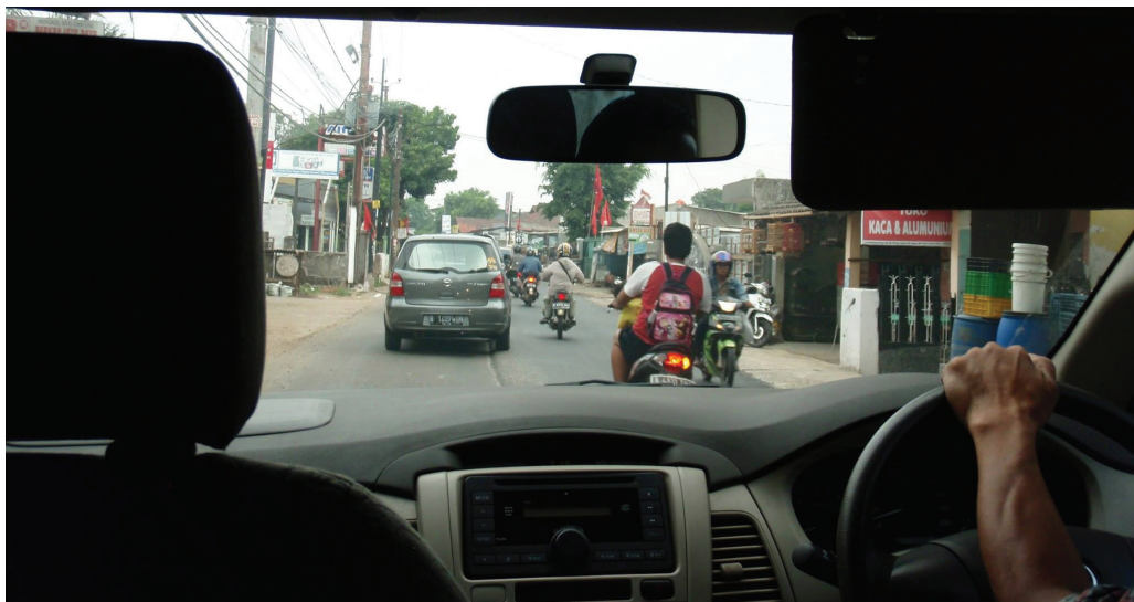
Figure 1: Driving on the side roads to the school

We crawl along a highway congested with rush hour traffic: expensive cars, scooters, lorries, vans, carts. People fill the roads. The highway is lined with glittering skyscrapers and tall palm trees. Billboards advertise new housing complexes, college courses and shopping malls. Behind and between there are informal dwellings, derelict spaces and smoking rubbish piles. Clothes hang on washing lines, belongings spill outside: chairs, tables, boxes, clothes, cupboards. A woman is pushing her food cart the wrong way up the busy slip road onto the highway. In the distance – a haze. The driver says the rainforest is burning. The heat, smell and noise are palpable inside the air-conditioned car (see Figure 1).