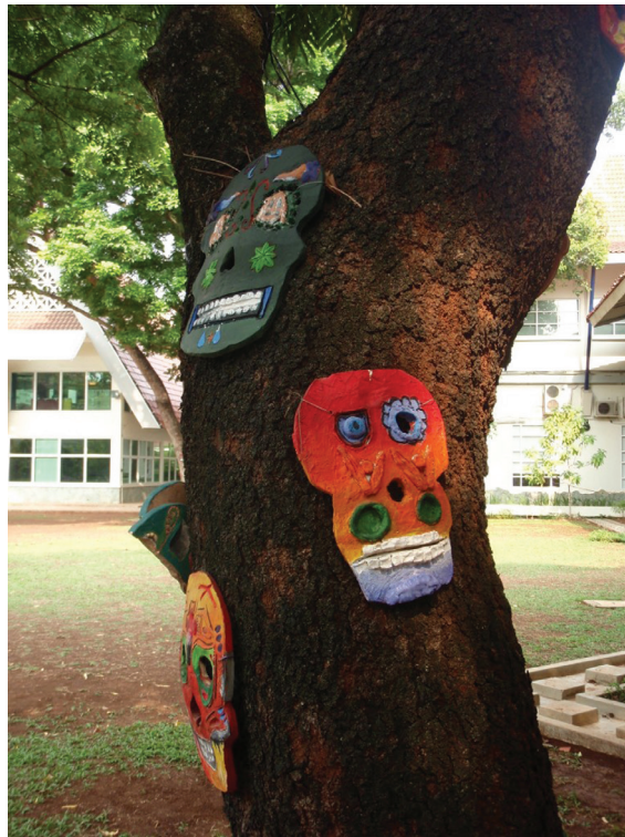
Figure 3: Student art: indigenous masks (Source: Elisabeth Barratt Hacking, 2015)

In posthumanist thinking, the agency to act is shared across the socio-material world: humans, nonhumans, plants, objects and things have agentic capacities. Bennett (2010: 32) refutes the idea of human intentionality as the only force able to bring about change and, instead, proposes the idea of distributed agency to represent 'a swarm of vitalities at play'. Distributed agency acknowledges that nonhuman forces, forms and matter (such as the sun, storms, water, gravity, electromagnetism) act together in distributed agency. Barad (2007: 33) challenges the minority world, humanist view that there are separate individual agencies that precede their interaction and argues for the need to replace this with the notion of 'intra-action' which 'recognizes that distinct agencies do not precede, but rather emerge through, their intra-action'.