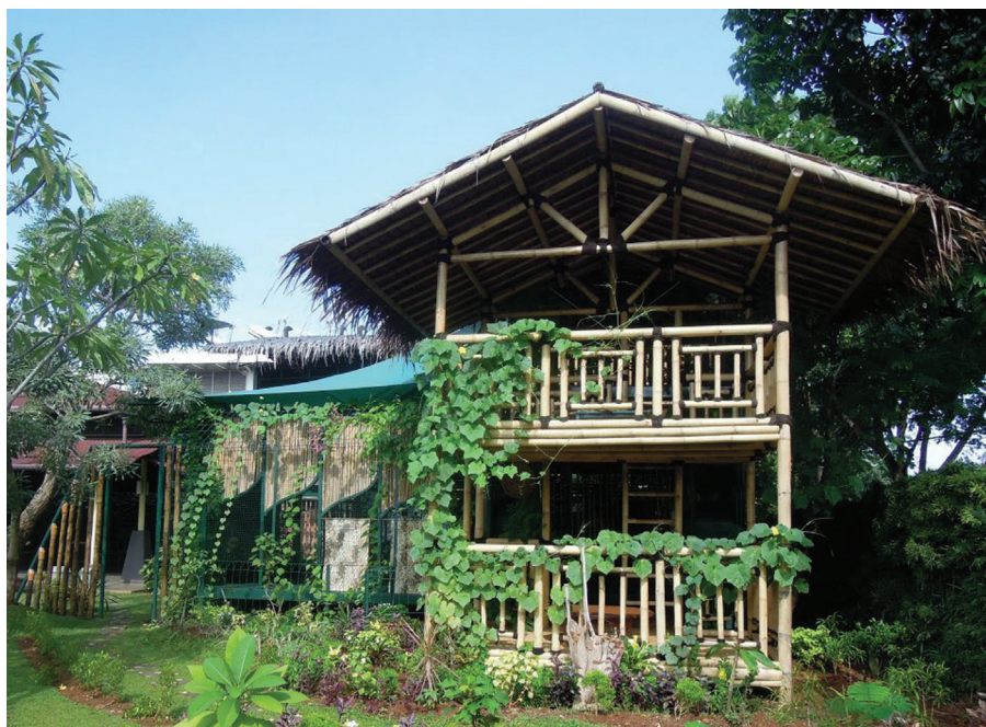
Figure 4: Sekolah Aman

We arrived, a mini green oasis. A line of small children greet us Indonesian style, huge smiles on their faces, and dressed in colourful batik shirts. It is an open-air school, set in the grounds of a multinational company which provides sponsorship. Built in steel and bamboo with a thatch roof, classrooms are divided by plants, bamboo and bookshelves (see Figure 4). Vegetation and building intertwine; vines creep up the chalkboard and down the bamboo divides; the external bamboo screens are alive with orchids, creepers and ferns.