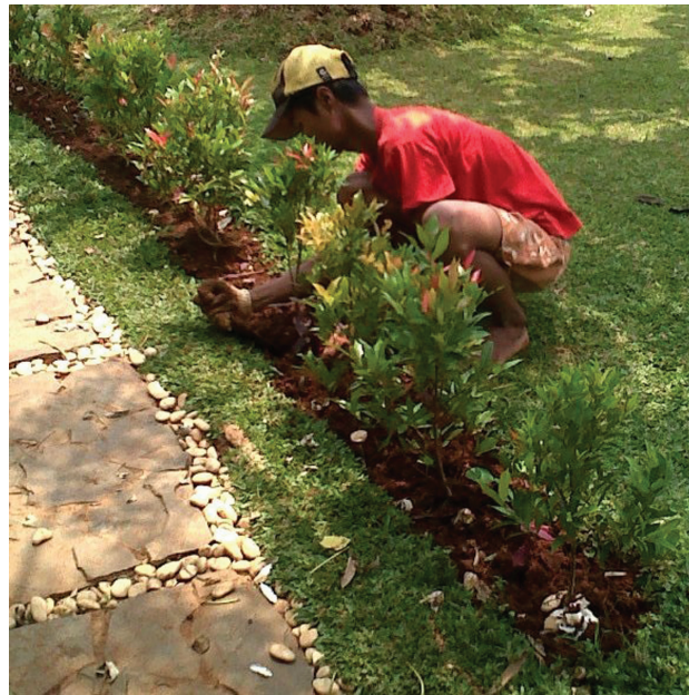
Figure 5: Sekolah Aman's gardener at work

The children have spent their previous short lives begging or scavenging on the rubbish tips, toxic from the burning plastic. I met the gardener (see Figure 5), two teachers and a cook/helper, all from the local community; the gardener was also previously scavenging. Every day the school provides a meal of fresh local food, cooked in situ for the children and staff. The teacher is a former pupil of Sekolah Aman. Following a scholarship into secondary education he is now studying accountancy at night school and works here every day.