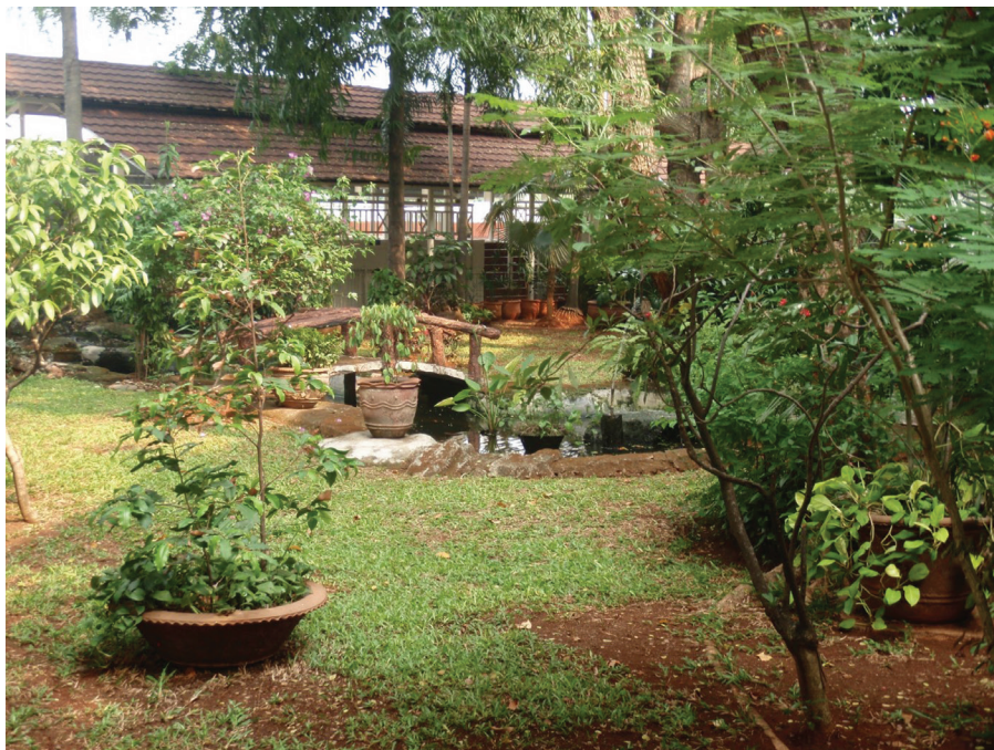
Figure 2: The indigenous garden

Exploring the school grounds. There was no one around, classes were on. Beautiful – so green, so shaded and still – in the tropical heat – a rainforest garden – an enclave within a depleted local environment. Birds singing, insects humming. The modern school buildings with sloping and overhanging rooves, and outdoor covered spaces: colonial architecture alongside vernacular Rumah Adat styles. The grounds are abundant with trees and indigenous plants, streams and bridges (see Figure 2). There are other cultural features. Stone circles form meeting places. International flags fly from the main building. Student art decorates the garden: hand painted maps on a wall; an Indonesian village model; colourful masks and other artefacts are hanging from the trees (see Figure 3). Signs warn of electric storms, and what to do in the event. A number of gardeners, local staff, are hunched over their work in their green and earth-coloured uniforms, screened from the sun by wide-brimmed hats, working quietly and methodically. A bell went off and suddenly the grounds were full of children moving along the walkways between buildings to their next lesson, then quiet again.