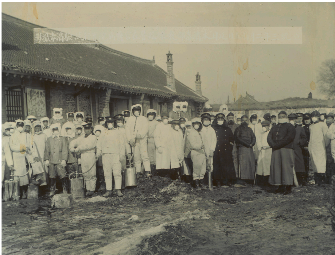
Figure 2 A disinfection squad wearing masks at Changchun plague hospital during the first pneumonic plague epidemic in Changchun, Manchuria in 1911.

Several studies described how the visual properties of masks played a key role in their ability to generate solidarity. The uniformity of mask shapes and designs commonly used by the public made them a powerful visual tool to materialise ‘sameness’ and unity. Anthropologist and historian Lynteris described this property while examining the early uses of face masks as a technology of containment during the 1910–1 plague outbreak in Manchuria. 32 Dr Wu Liande, credited as the inventor of the 20th century face mask, created a photographic album of his efforts during the plague. It contained 47 photographs of humans, 32 of them masked men. The photographs created a powerful ‘spectacle of masked unity’ that reverberated across the scientific world (figure 2). Baehr also observed the visual properties of photographs with large numbers of masked persons as a means to communicate social ‘sameness’ and solidarity in the context of the 2003 SARS epidemic in Hong Kong: ‘By blurring social distinctions, it (the mask) produced social resemblance. Mask-wearing activated and reactivated