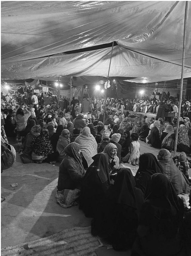
Figure 1: Protesters at Shaheen Bagh.

The popular sentiment that “something” has changed since the formation of the two BJP-led governments (in 2014 and 2019) has taken strong root. However, just as palpably, there is the perception that “ordinary” citizens—such as those at Shaheen Bagh—have begun to raise their voice against the dilution of constitutional ideals that, putatively, guide the conduct of governance and relationships between the state and its citizens. “Constitutional values” and their defense by “ordinary”