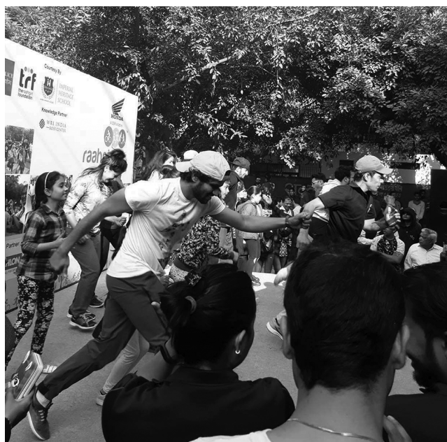
Figure 3: Raahgiri participants, Gurgaon.

Further along, there is a mini soccer ground, sponsored by a local soccer coaching business. It displays the banner of a European football club that has a tie-up with the company. Groups of children are also playing badminton. Along various footpaths, there are small billboards of various corporate sponsors. Among them there are some that say “ Hindustan Times Raahgiri,” while others proclaim “ Times of India Raahgiri.” Other groups have also joined in the crowds taking part in aer-