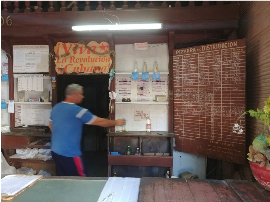
Figure 4 ‘¡Viva la revolución cubana!’ Behind the counter of la bodega , with ‘board of distribution’ showing quantities of goods to which local residents are entitled [Colour figure can be viewed at wileyonlinelibrary.com ]

so my cats stay here. It’s better to have cats than to have mice.’ Furthermore, the sense of the bodega as part of the neighbourhood’s social landscape relates also to this particular bodeguero ’s personal popularity. He’s a ‘good guy’ ( buena gente ), people in the neighbourhood say, fun to be around, charismatic and easy to deal with. With secondary-school education, and now in his 40s, the bodeguero has been in charge of this particular bodega for 22 years, and is by all accounts well embedded in the neighbourhood. As one neighbour put it, ‘the bodeguero has been in this bodega for so many years that it’s almost like he owns it. He’s had relationships with various girls from the neighbourhood and he’s quite a guy, but since he has money lots of them want to be with him.’