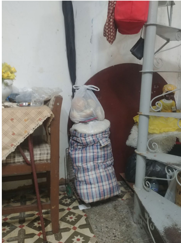
Figure 1 Bags of ' mandados ' kept in the home – rice and bread from the bodega [Colour figure can be viewed at wileyonlinelibrary.com ]

dietary provisions. 4 In interactions with the SSP, then, the notebook comes to serve as a prime means of identification, representing the family's entitlements within the system, as well as recording their use on a monthly basis, acting in this way as a kind of bureaucratic metonymy for the family itself. In fact, one may think of the notebook's metonymic status as operating in two directions at once. In one direction, it allows the family to which it belongs (and which it represents in Alfred's Gell's indexical sense of 'acting as a representative of'; 1998: 98) to project itself into the administrative processes of the SSP. In the other direction, understood as an official document in its own right – a document 'of the state' – its presence inside the home renders the notebook a prime vehicle for the state's metonymic projection into the intimate sphere of family life.