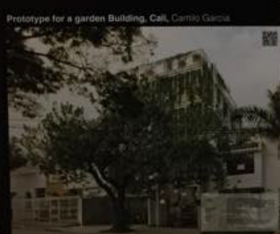
Prototype for a garden Building, Cali, Camilo García