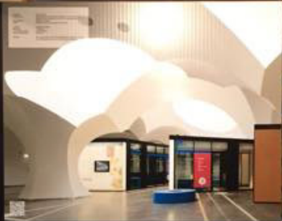
Town Hall and Civic Centre in OostKamp, Carlos Arroyo