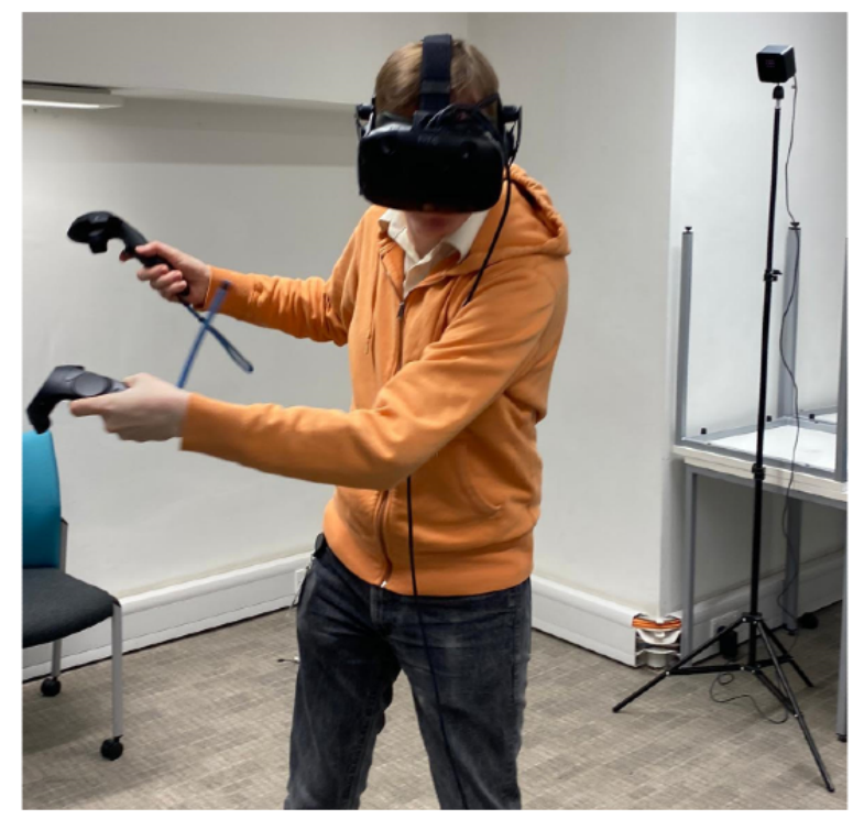
Figure 2. A player during Walls gameplay.